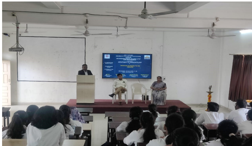
SPEAKER DELIVERING THE LECTURE