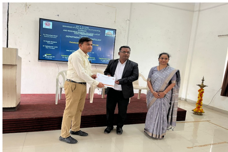
PRESENTING CERTIFICATE OF APPRECIATION TO THE SPEAKER