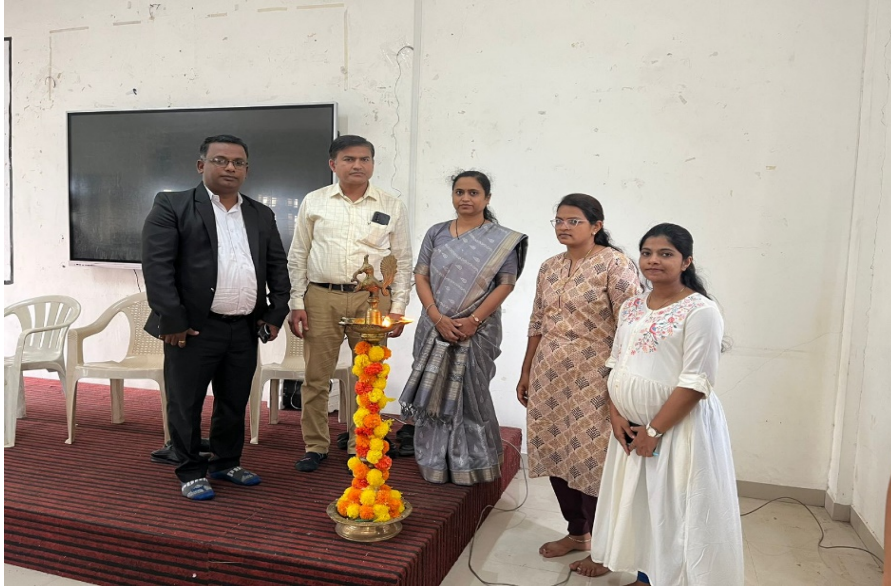
INAUGARATION AND LAMP LIGHTING