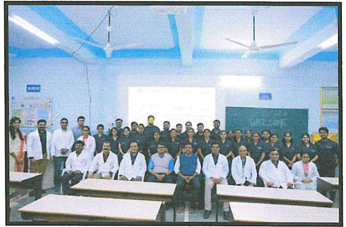
Orientation Program for the year 2024