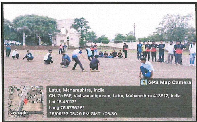
Students Playing Kho-Kho And Kabadi