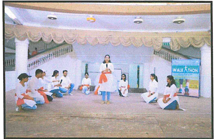
Street Play On "Ek Daant"