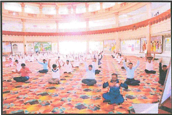
Staff And Students Performing Yoga In