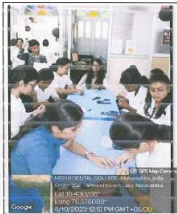
Students Working During Competition