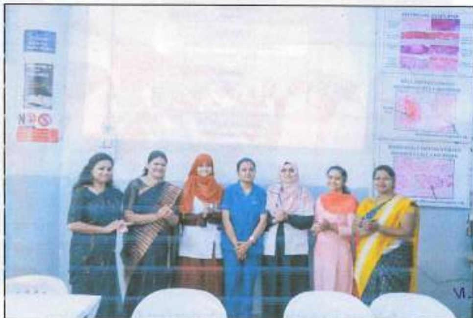
Prize Distribution to Winning Team

[Signature] Principal M. J. D. S. R. Dental C LATUR