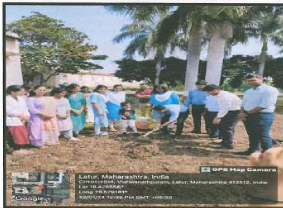
Tree Plantation on occasion of Prosthodontics Day