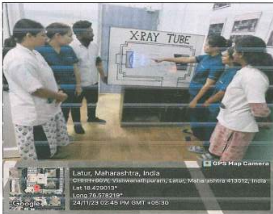
Presentation on Submitted Dental Study Model of X-Ray Tube

Email: principal@mitmidr.edu.in midr.latur@gmail.com Website: www.mitmidr