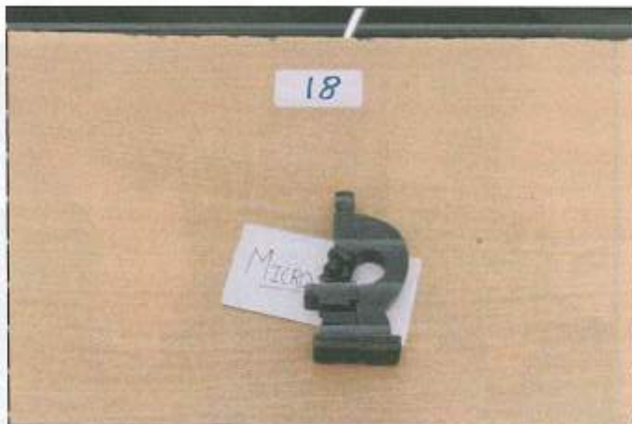
Microscope Carving Submitted Work During Competition