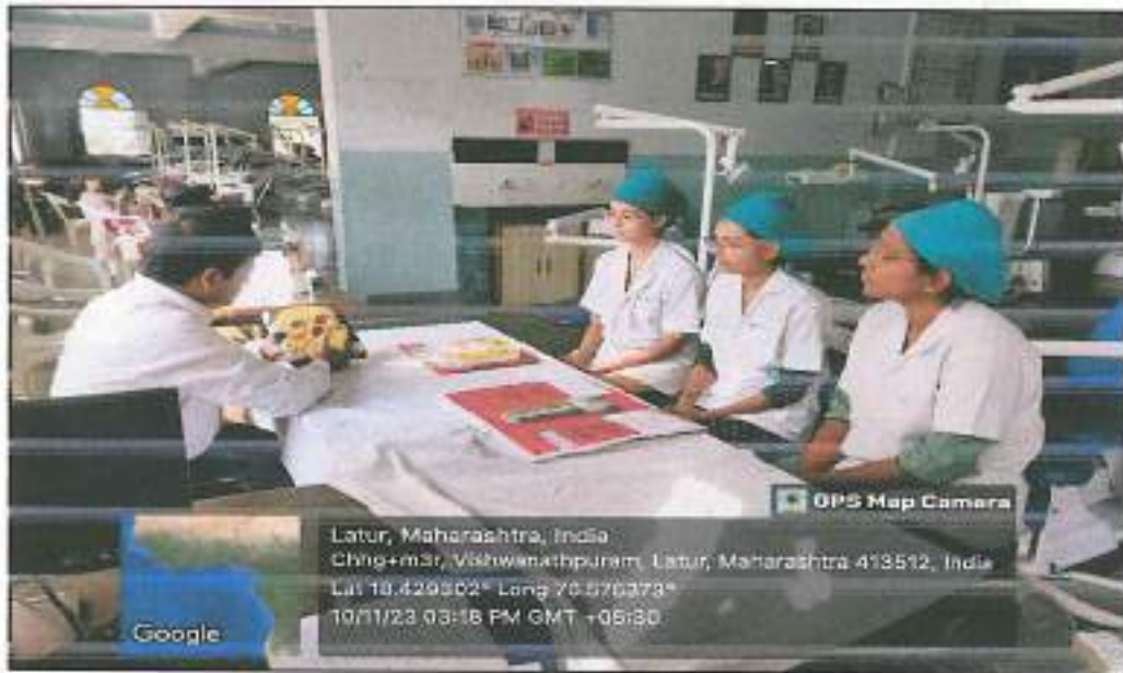
Discussion on Submitted Dental Study Model

Email: principal@mitmidr.edu.in midr.latur@gmail.com Website: www.mitmidr