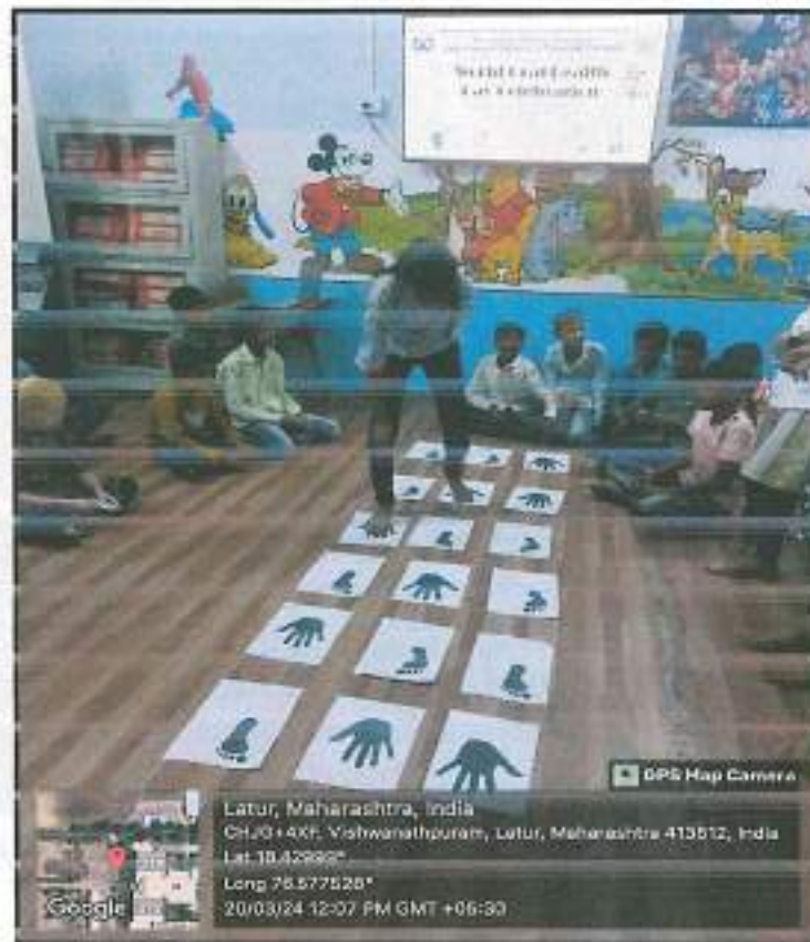
Hand & Feet competition an account of World Oral Hygiene Day

Email: principal@mitmidsr.edu.in midsr.latur@gmail.com Website: www.mitmidsr