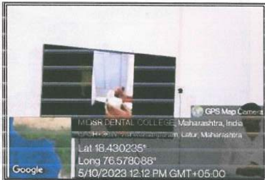
Presentation of Reel

Email: principal@mitmidr.edu.in midr.latur@gmail.com Website: www.mitmidr