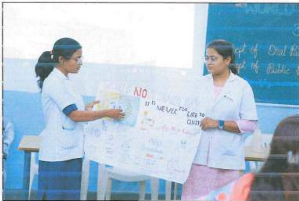
Student Presenting Poster on the Occasion of World No Tobacco Day 2024

Email: principal@mitmidr.edu.in midr.latur@gmail.com Website: www.mitmidr