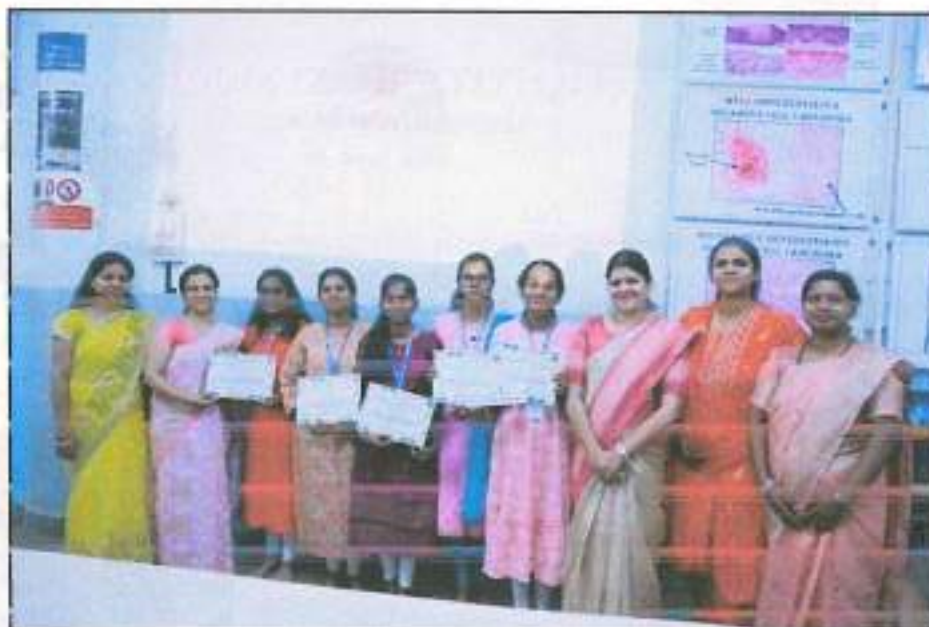
Prize Distribution to Winning Team

[Signature] Principal I. D. S. R. Dental C LATUR