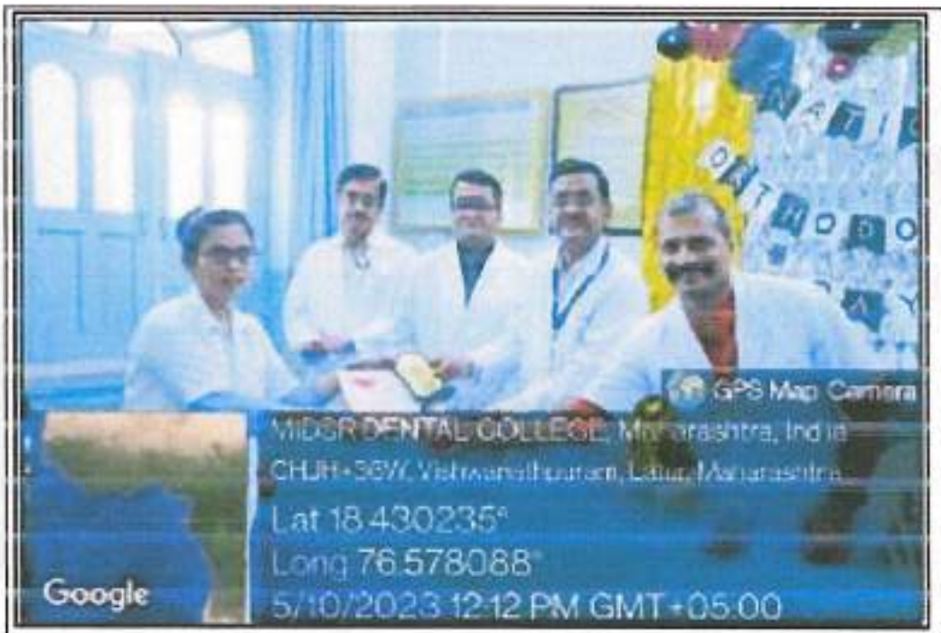
Prize Distribution to Winner

Email: principal@mitmidr.edu.in midr.latur@gmail.com Website: www.mitmidr