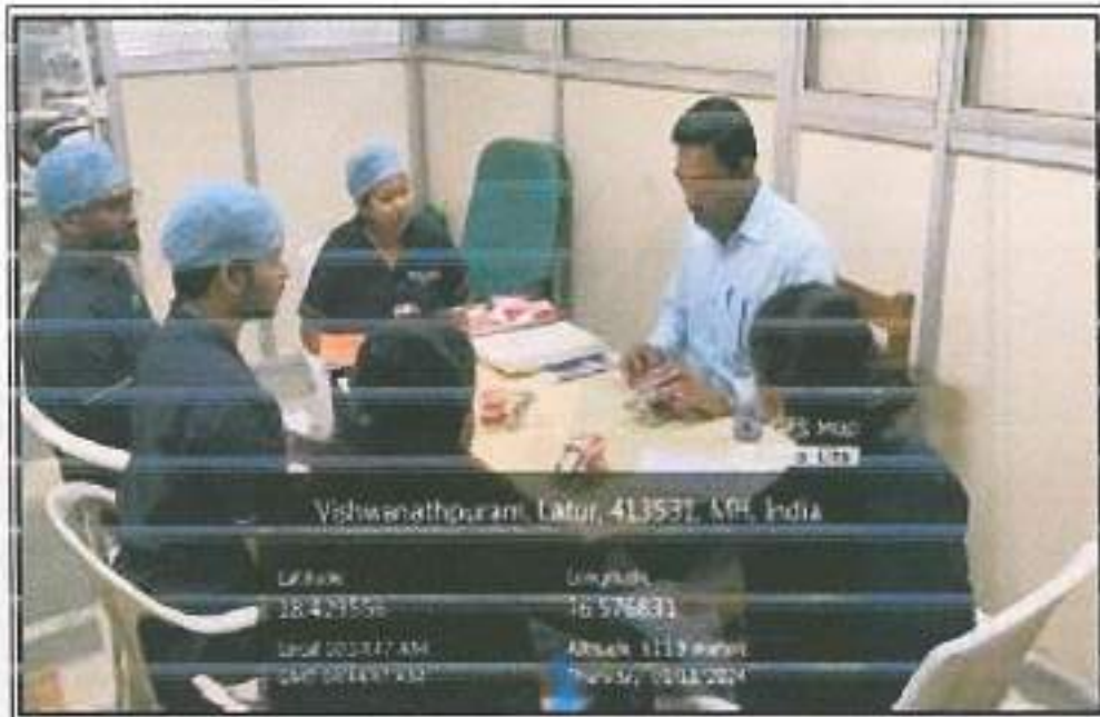
Faculty Guiding Students During MBT Workshop