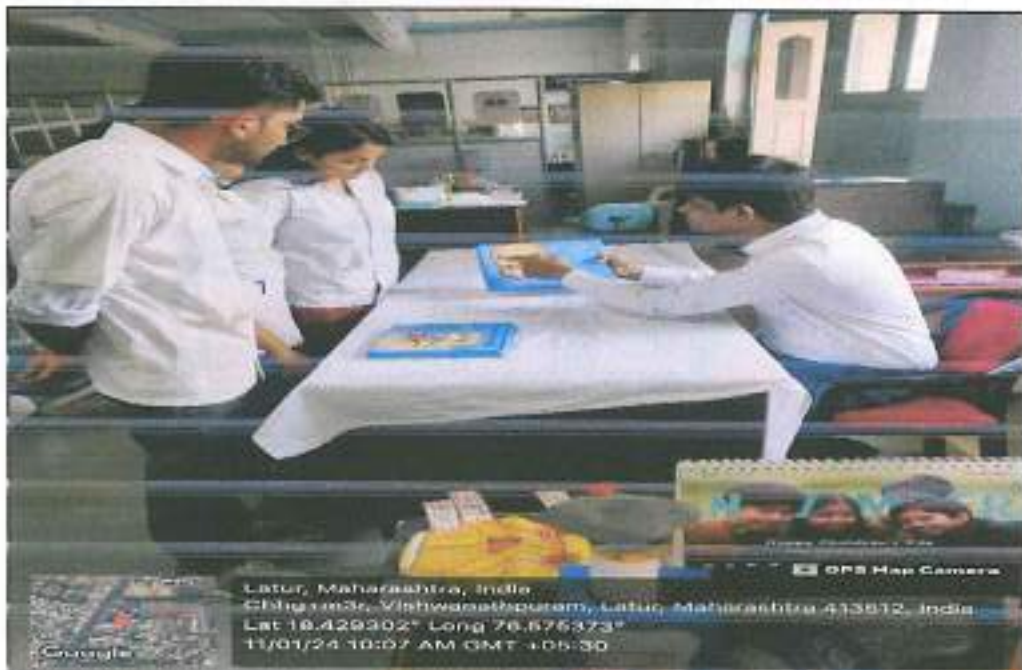
Discussion on Submitted Dental Study Model