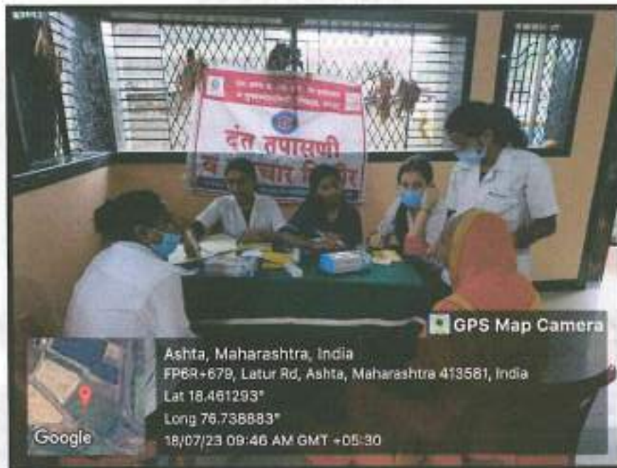
Patient Counselling during Dental Camp

Email: principal@mitmidr.edu.in midr.latur@gmail.com Website: www.mitmidr