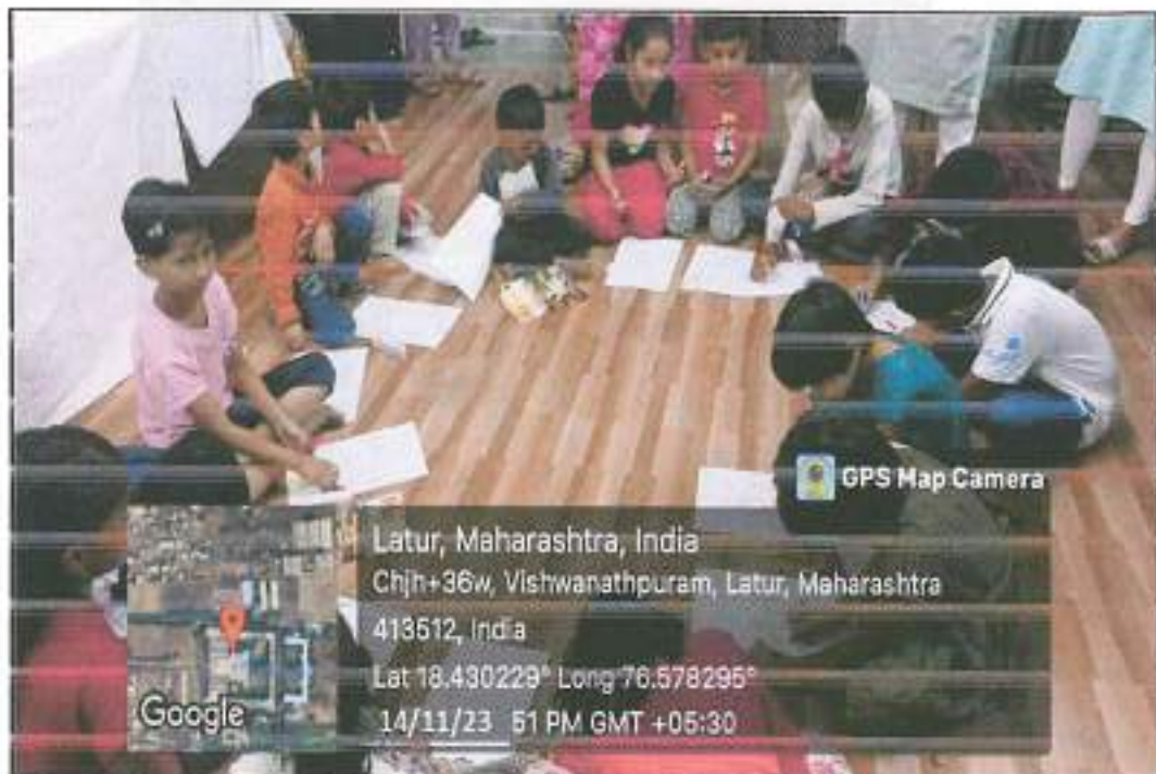
Drawing competition an account of World Oral Hygiene Day