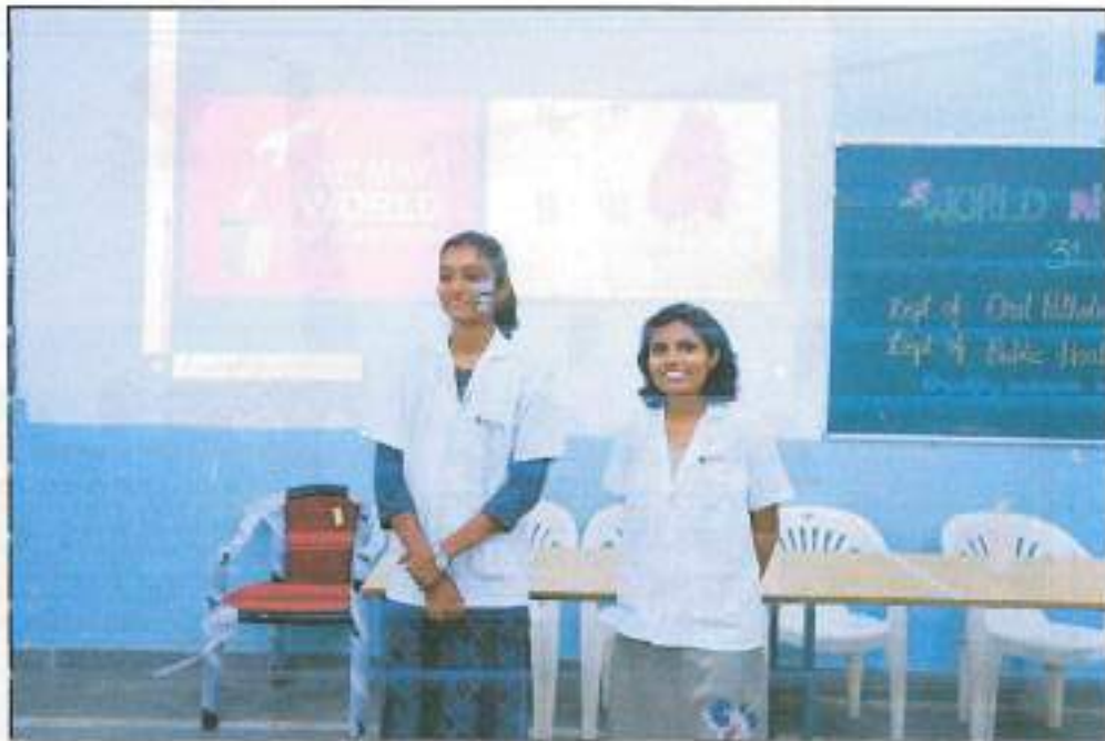
Student Presenting Face Painting on the Occasion of World No Tobacco Day 2024