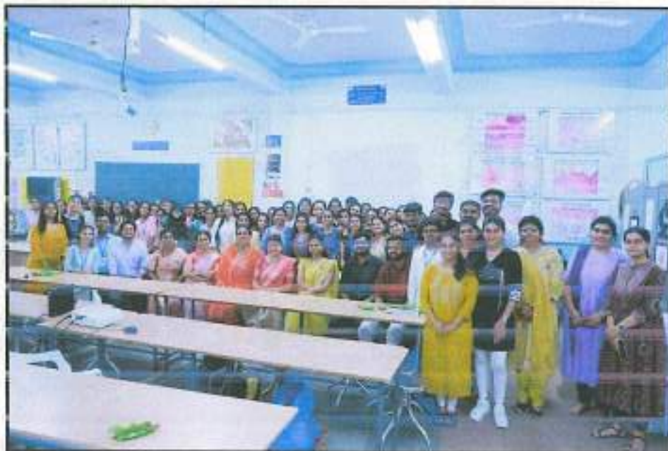
Participants & organising Students of Quiz Competition on Oral Pathologists Day

Email: principal@mitmidr.edu.in midr.latur@gmail.com Website: www.mitmidr