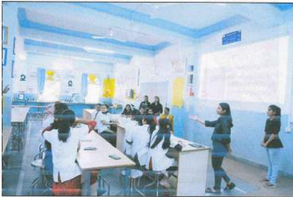
Quiz Competition on Oral Pathologists Day