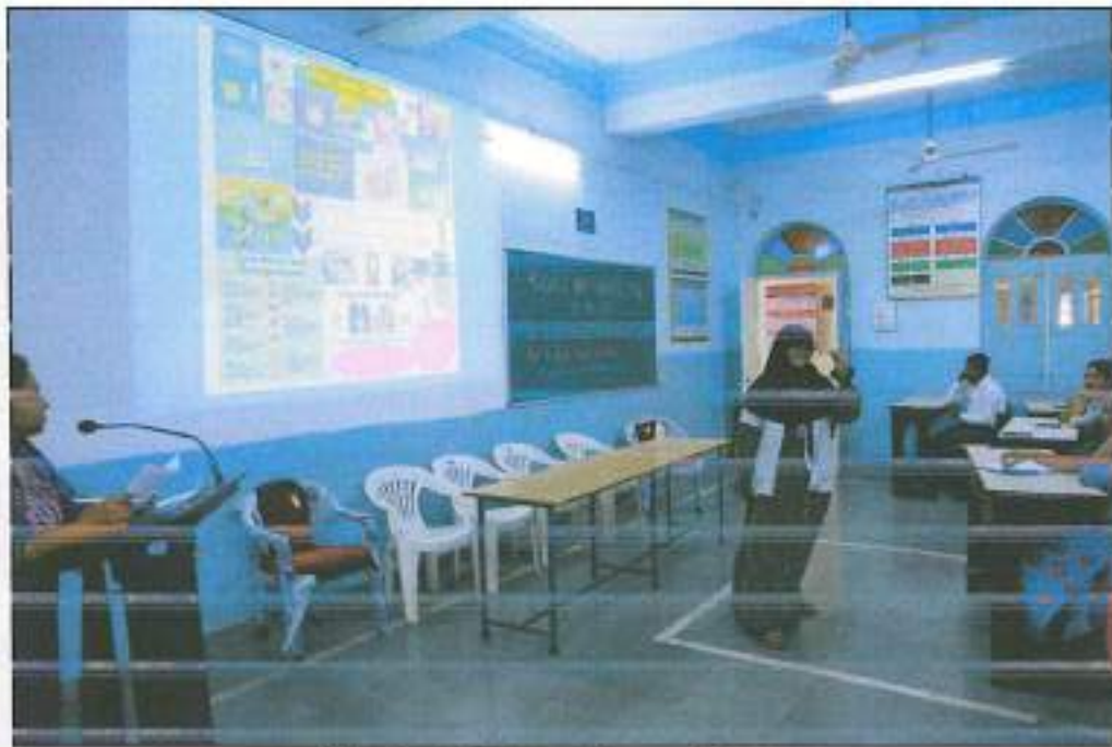
Student Presenting e-Poster