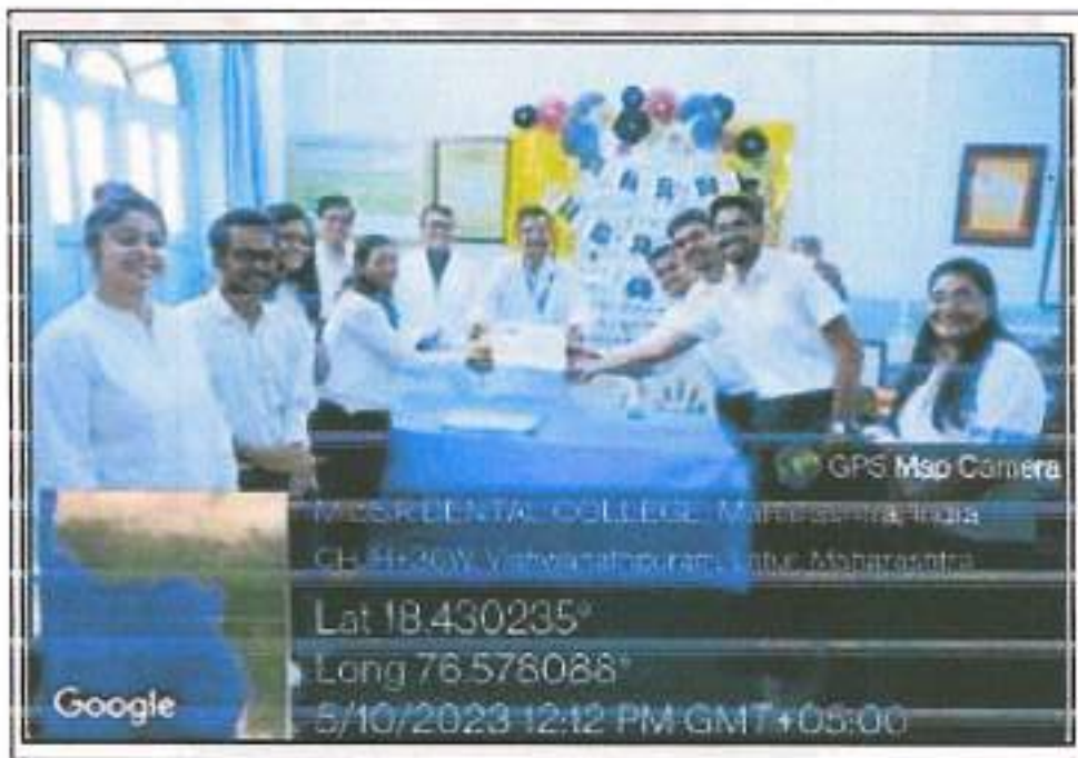
Prize Distribution to Winner

Email: principal@mitmidr.edu.in midr.latur@gmail.com Website: www.mitmidr