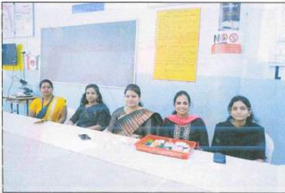
Submitted Work During Competition on Oral Pathologists Day