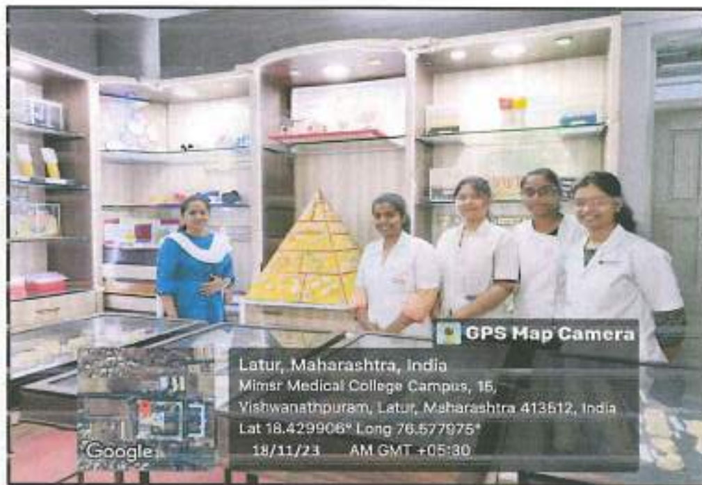
Submission of Dental Study Model

Email: principal@mitmidr.edu.in midr.latur@gmail.com Website: www.mitmidr