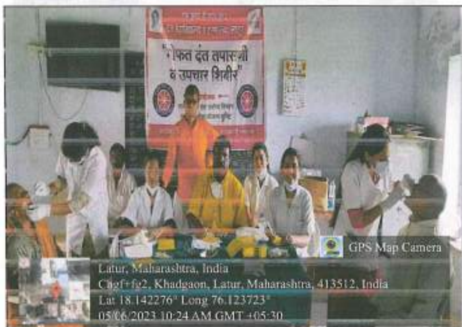
Students during Free Dental Check-up Camp