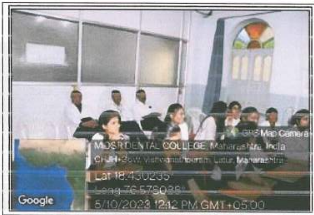
Best Smile Competitions