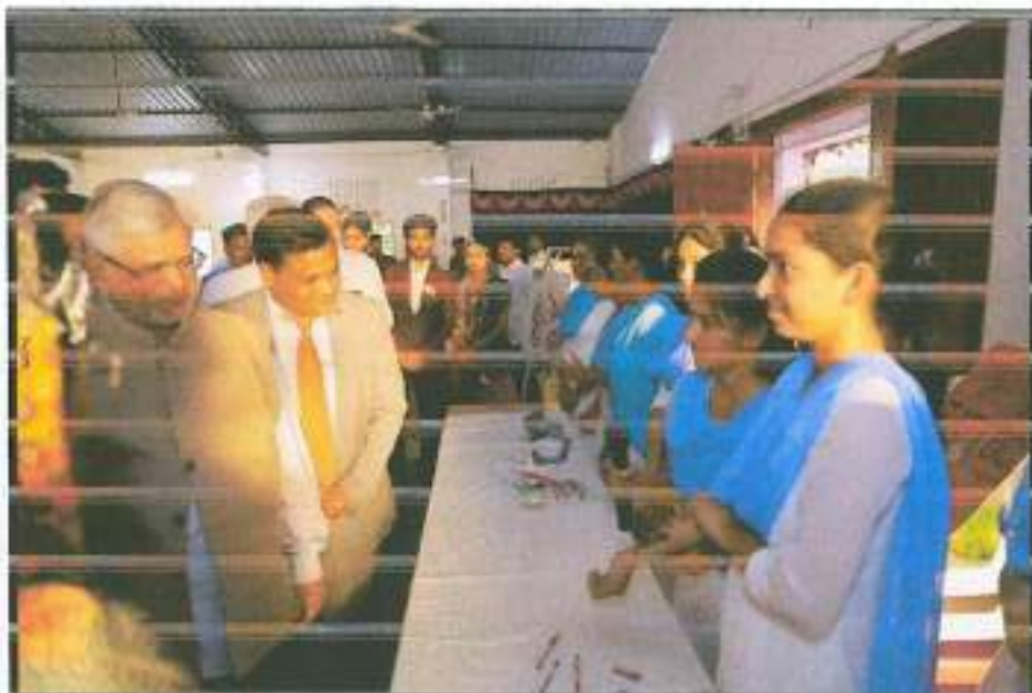
Guests Examining Work during Competition