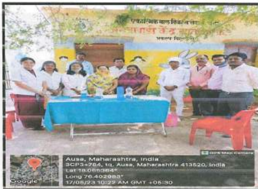
Dental Check-up at Primary Health Care Centre

Email: principal@mitmidr.edu.in midr.latur@gmail.com Website: www.mitmidr