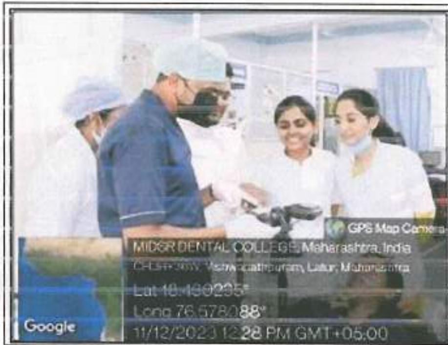
Students Examining Patient During Photographic Workshop