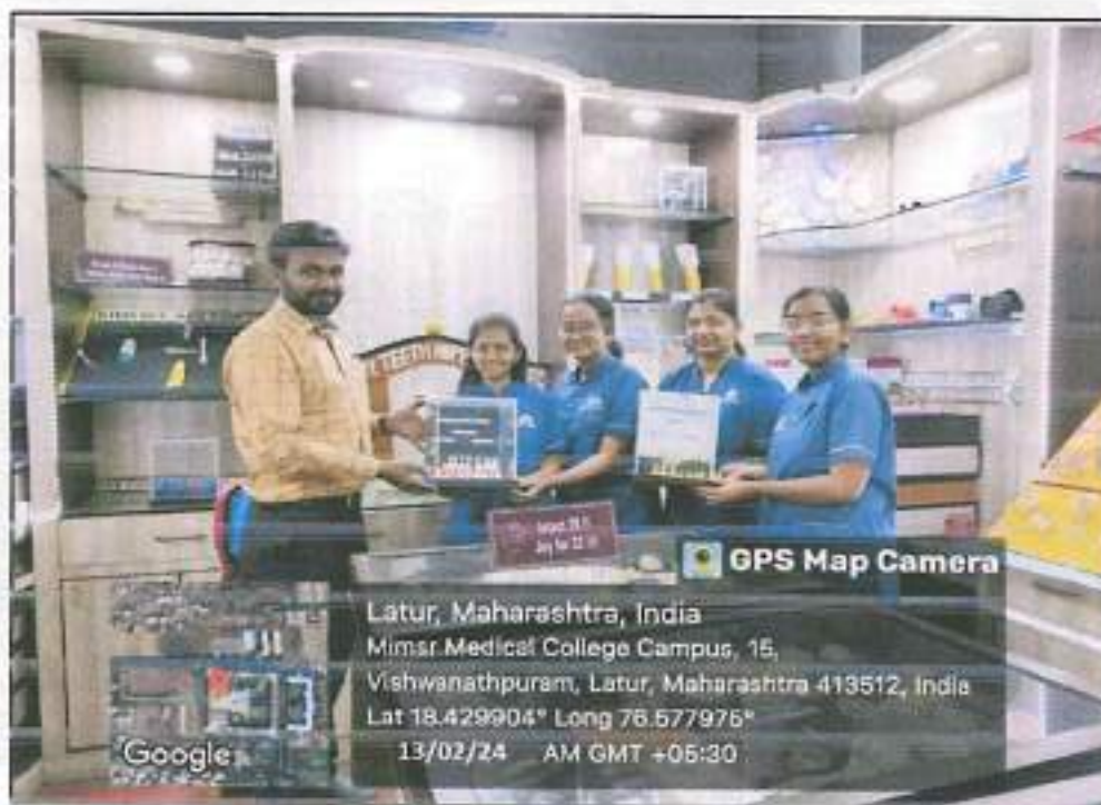
Submission of Dental Study Model

Email: principal@mitmidr.edu.in midr.latur@gmail.com Website: www.mitmidr