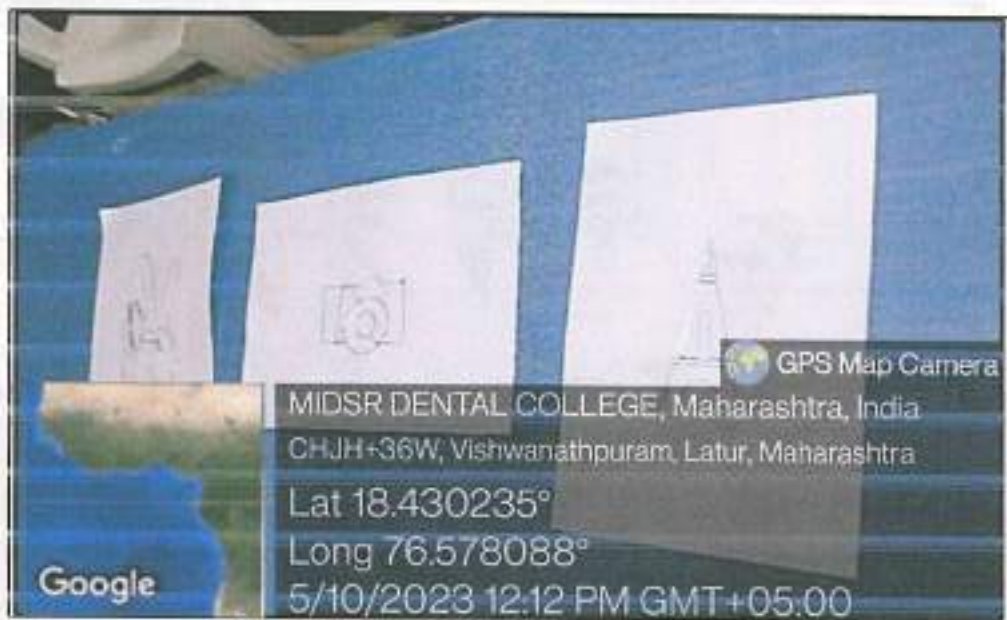
Some of the innovative wire bending

Email: principal@mitmidr.edu.in midr.latur@gmail.com Website: www.mitmidr