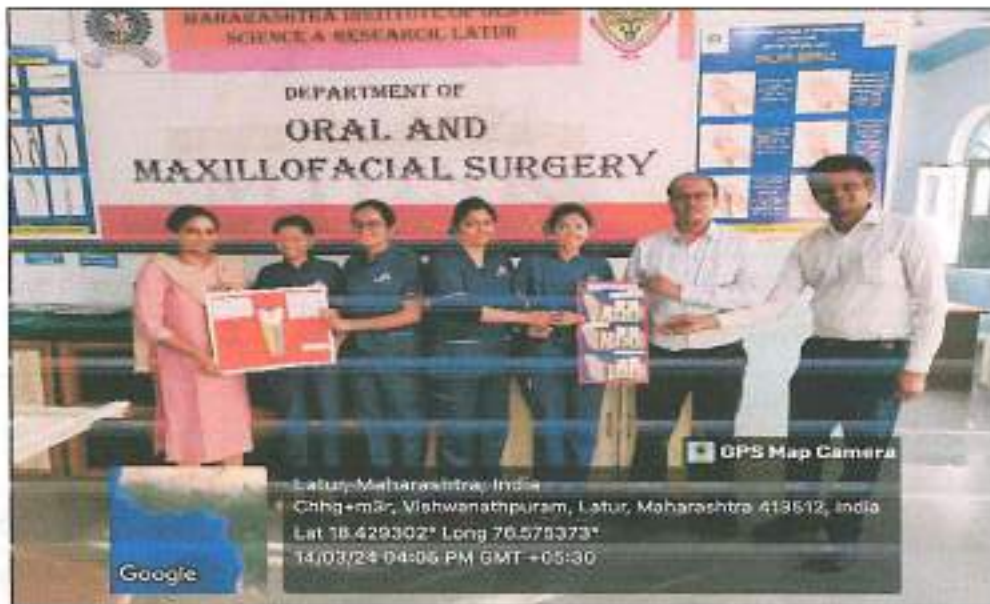
Students Presenting Dental Models