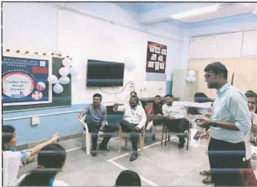
Quiz Competition on Prosthodontist Day

Email: principal@mitmidr.edu.in midr.latur@gmail.com Website: www.mitmidr