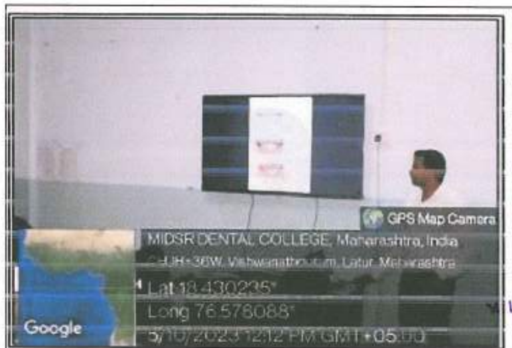
Student Presenting The Case