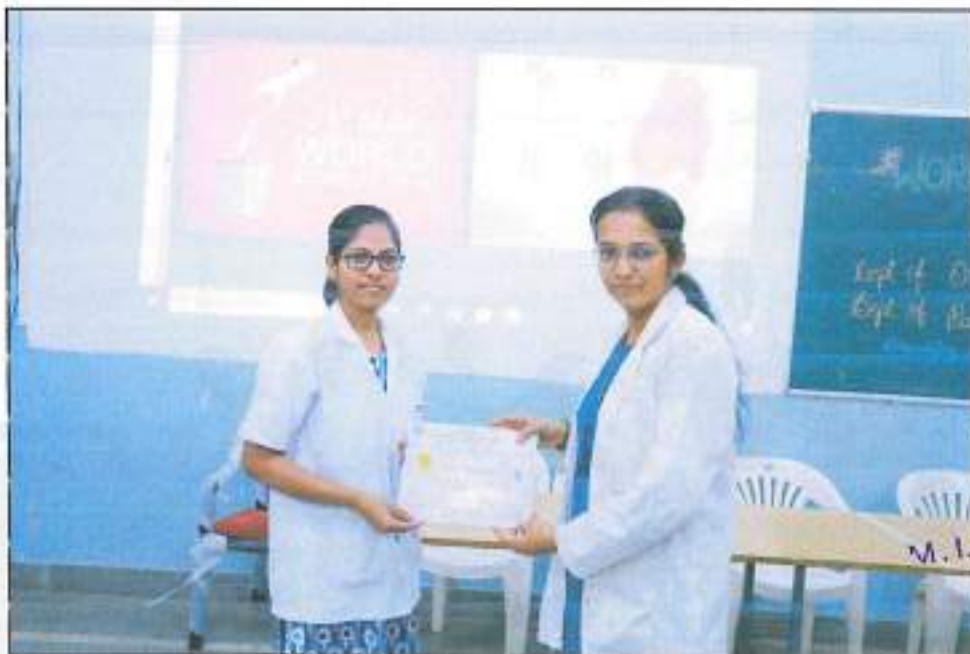
Prize Distribution to Winner

Signature Principal M.I. D. S. R. Dental C LATUR