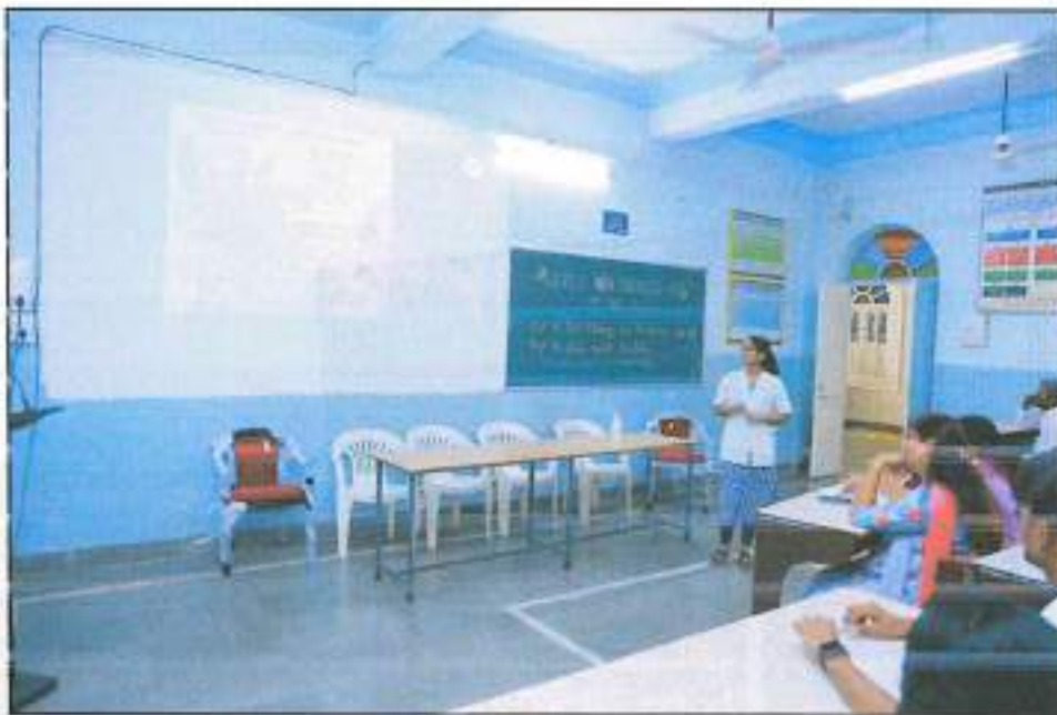
Student Presenting Reel on the Occasion of World No Tobacco Day 2024