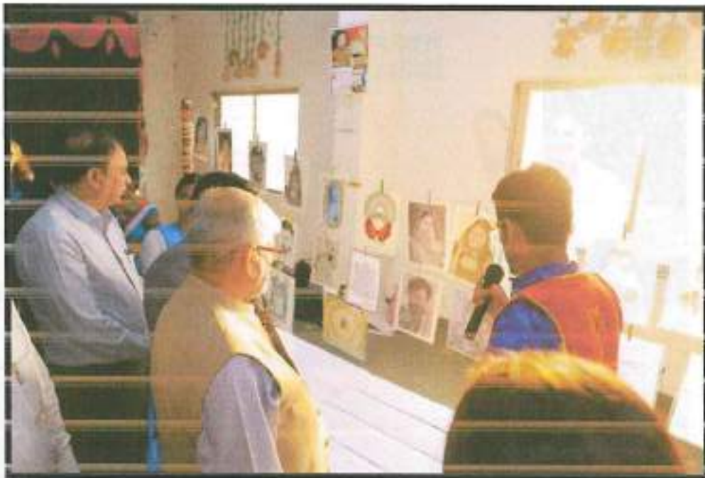
Submitted Work During Competition