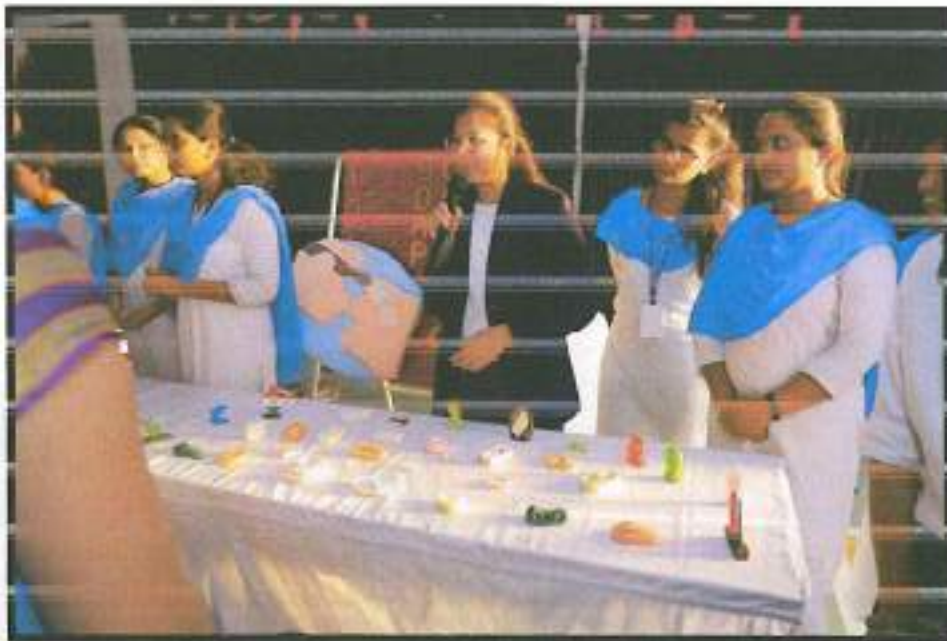
Students Presenting Their Work During Competition

Email: principal@mitmidr.edu.in midr.latur@gmail.com Website: www.mitmidr