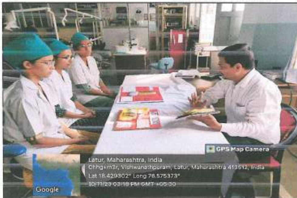
Discussion on Submitted Dental Study Model