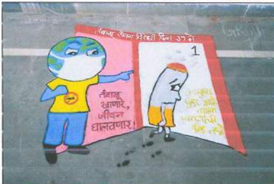
Submitted Work During Competition on World No Tobacco day

Email: principal@mitmidr.edu.in midr.latur@gmail.com Website: www.mitmidr