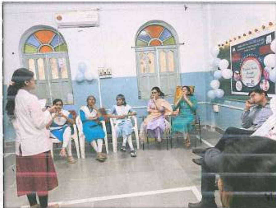
Quiz Competition on Prosthodontist Day