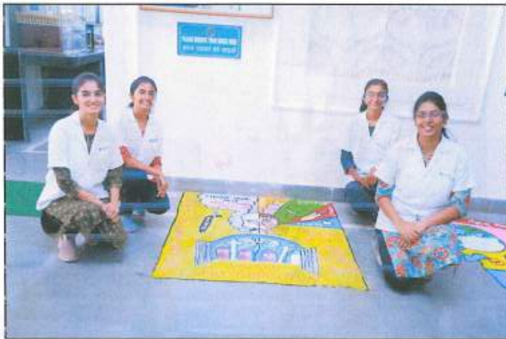
Participating Students in Competition on World No Tobacco day