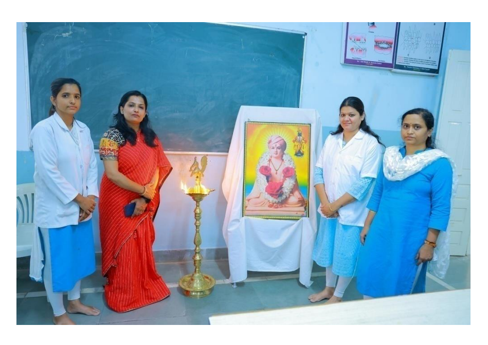
Lamp lightening ceremony