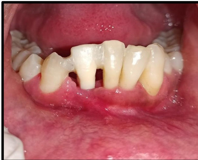
AFTER PLACEMENT OF NATURAL PONTIC