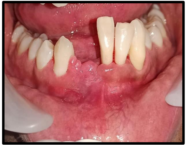
MANDIBULA FRONTAL VIEW AFTER EXTRACTION W.R.T. 42