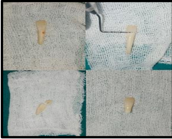
CUT THE NATURAL PONTIC