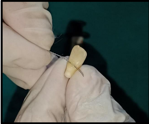
LIGATURE WIRE SPLINT WITH PONTIC