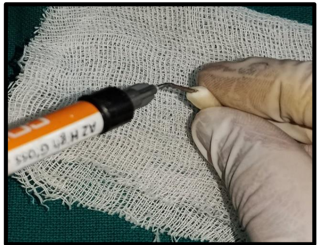
CANAL WIDNING AND COMPOSITE FILLING DONE