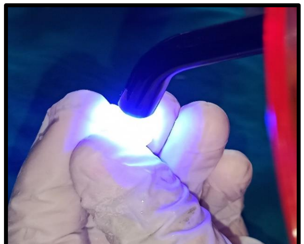
LIGHT CURE APPLICATION