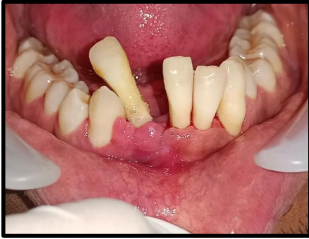
MANDIBULA FRONTAL VIEW BEFORE EXTRACTION