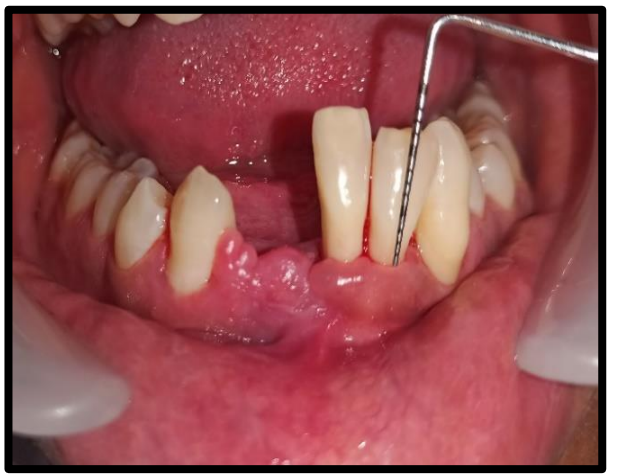
MESURED LENGTH OF #32