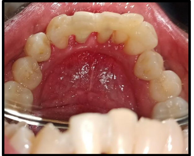
LINGUAL VIEW AFTER PLACEMENT OF NATURAL PONTIC