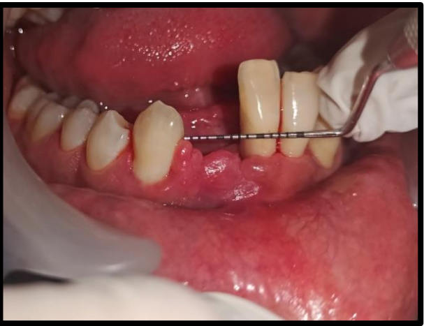
LENGTH AND WIDTH IN EXTRACTION SITE