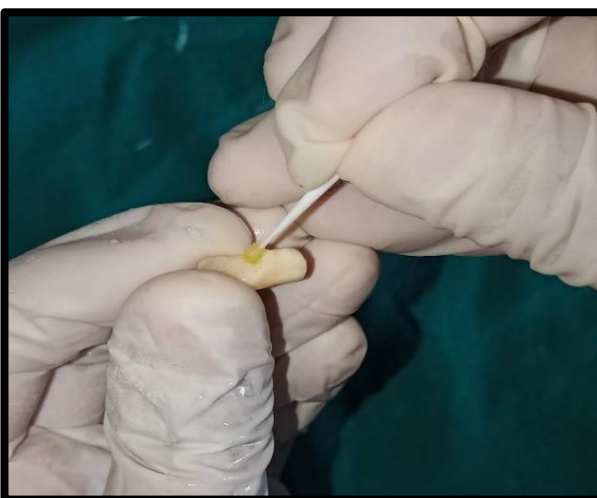
BONDING AGENT PPLICATION