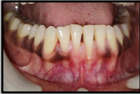
PRE-OPERATIVE FRONTAL VIEW