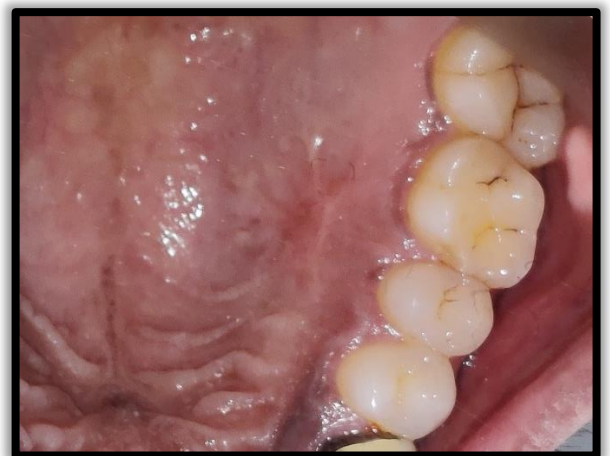
4 MONTH FOLLOW UP WITH PALATAL VIEW