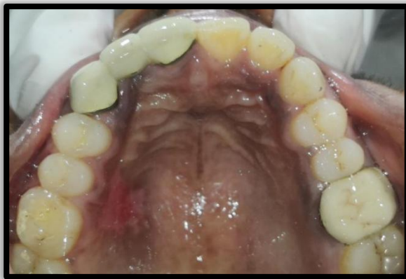
1 MONTH FOLLOW UP WITH PALATAL VIEW