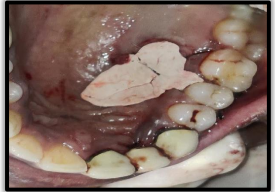
COE PACK PLACED OVER DONOR SITE