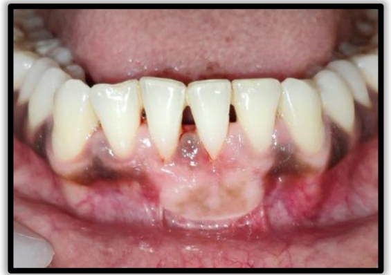
4 MONTH FOLLOW UP