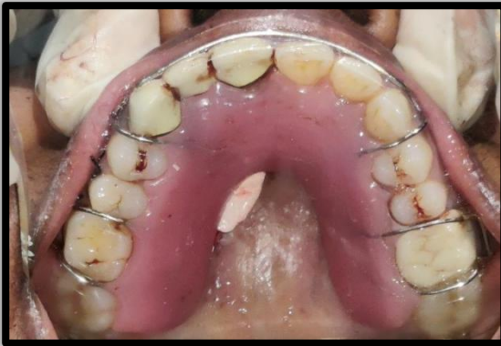
HAWLEY APPLIANCE PLACED OVER DONOR SITE