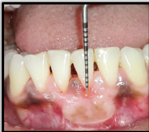
4 MONTH FOLLOW UP WITH