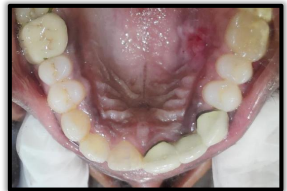
15 DAYS PALATAL VIEW AFTER SUTURE REMOVAL