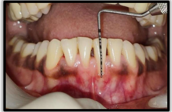
RECESSION HEIGHT = 5 MM