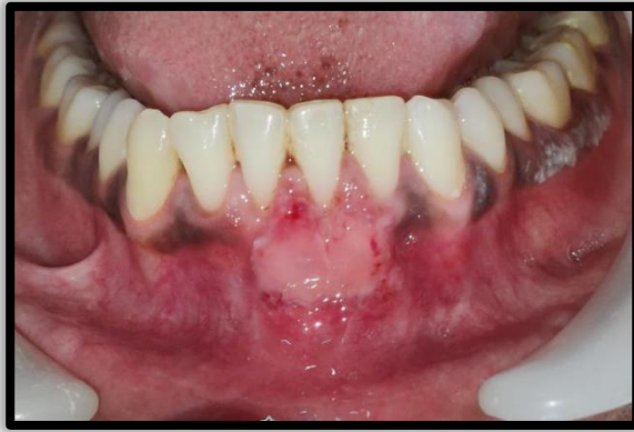
15 DAY FOLLOW UP AFTER SUTURE REMOVAL