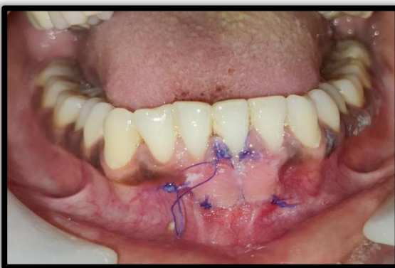
15 DAYS BEFORE SUTURE REMOVAL