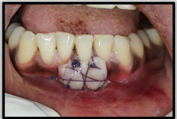
1 DAY AFTER SURGICAL PROCEDURE