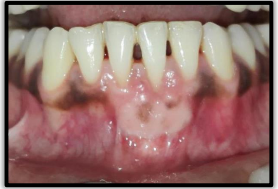
1 MONTH FOLLOW UP