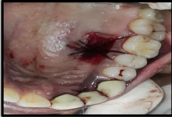
SUSPENSORY SUTURE PLACED OVER DONOR SITE