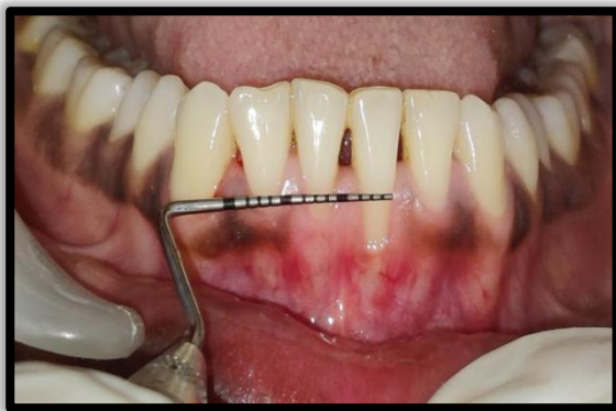
RECESSION WIDTH = 3 MM