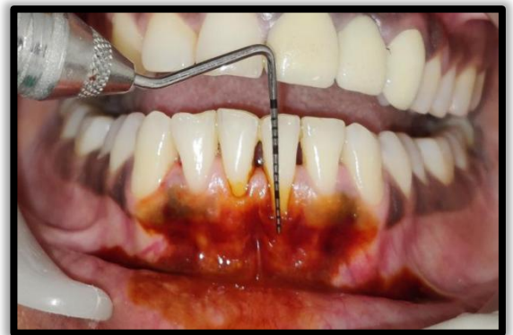
STAINING WITH LUGOL'S IODINE