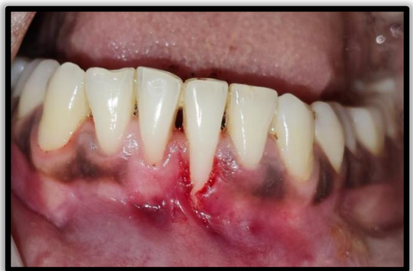
RECESSION DEFECT WRT #31 AFTER ROOT PLANING