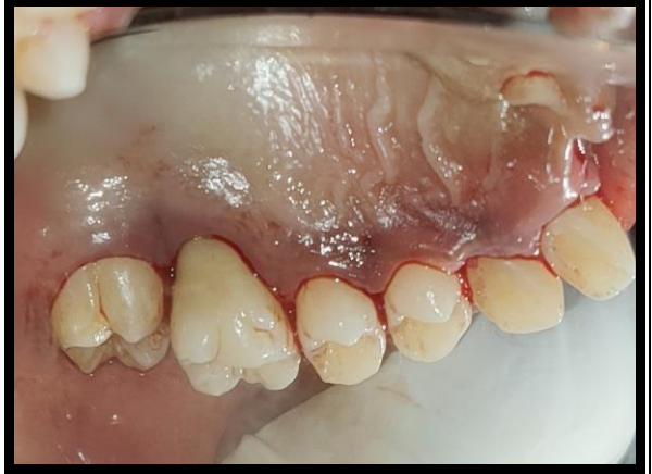
PALATAL SULCULAR INCISION