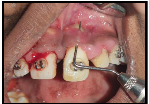
SOFT TISSUE DEHISCENCE