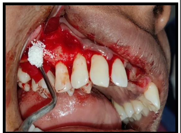
BONE GRAFT PLACEMENT WITH #16