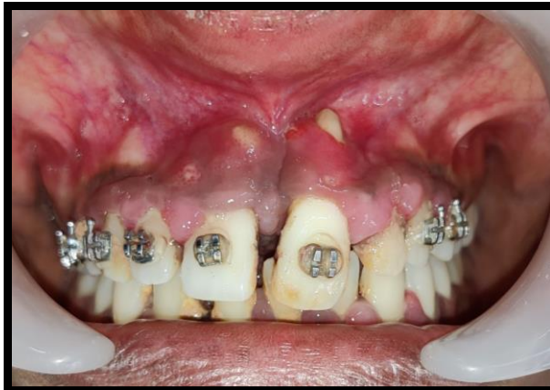
PREOPERATIVE FRONTAL VIEW