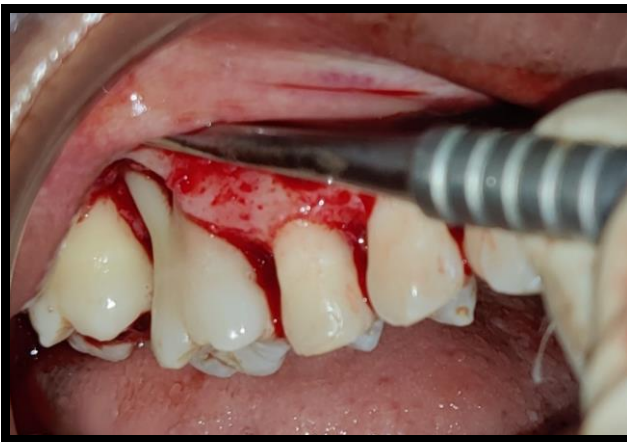
FLAP REFLECTION AND LOCATE INTRABONY DEFECT