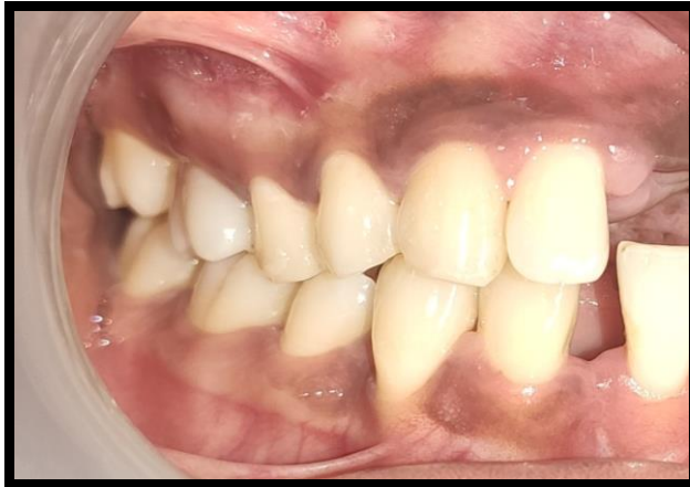
15 DAYS FOLLOW UP