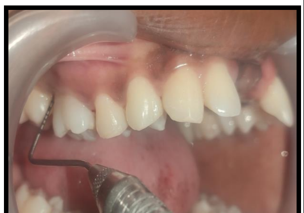
PREOPERATIVE RIGHT MAXILLARY VIEW