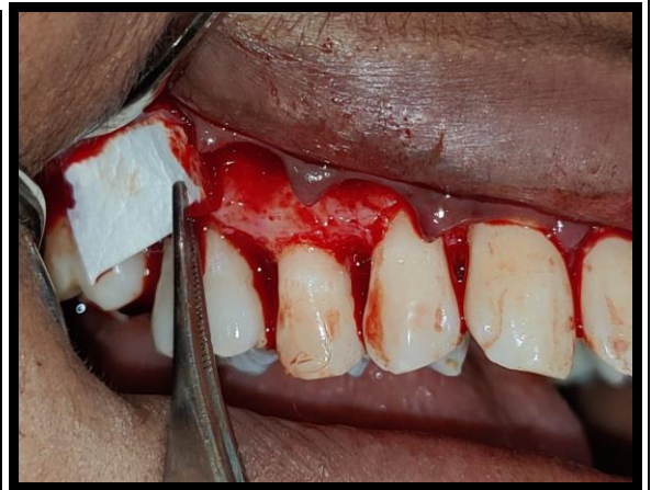
GTR MEMBRANE PLACEMENT WITH #16