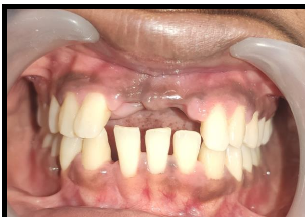
FRONTAL VIEW AFTER EMERGENCY PHASE