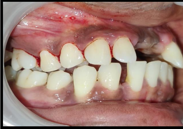
BUCCAL SULCULAR INCISION