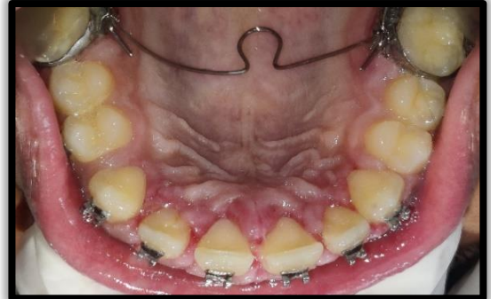
7 DAYS AFTER SUTURE REMOVAL PALATAL VIEW