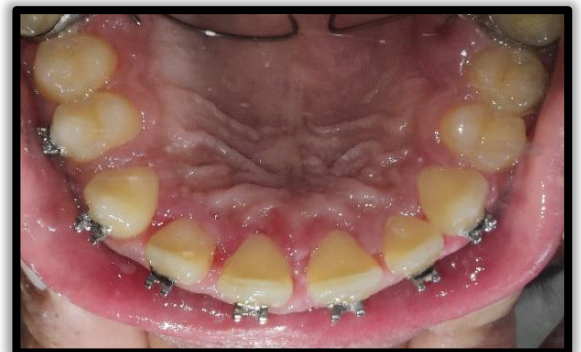
1 MONTH FOLLOW UP PALATAL VIEW