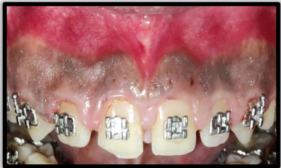
BLEEDING POINTS MARKED IN MAXILLARY ANTERIOR GINGIVA