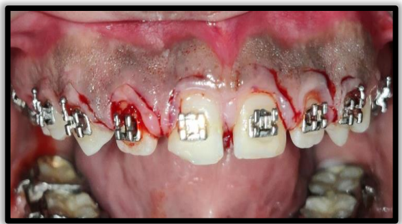
EXTRNAL BEVEL INCISION GIVEN WITH BLADE TOWARDS TEETH