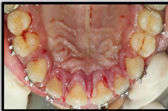
EXTRNAL BEVEL INCISION GIVEN WITH PALATEL VIEW