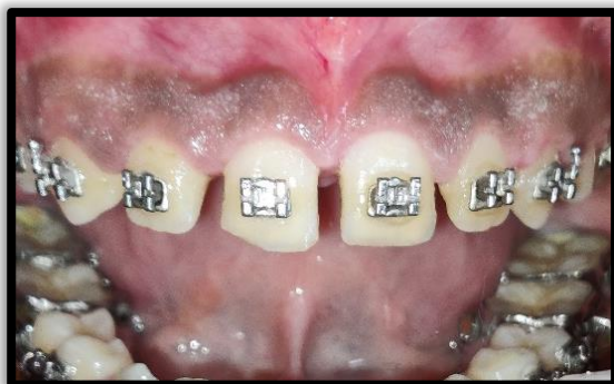
1 MONTH FOLLOW UP