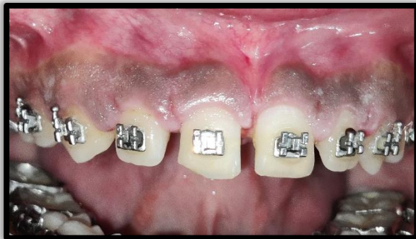
7 DAYS AFTER SUTURE REMOVAL