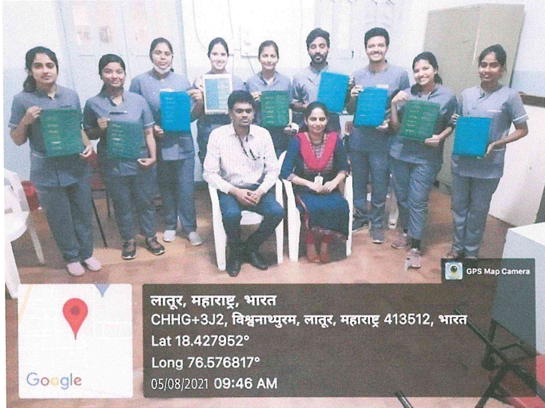
Sutures & Suturing Techniques Hands on