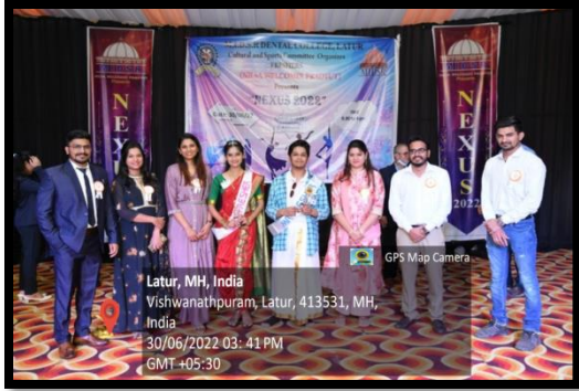
CULTURAL COMMITTEE WITH MR. AND MISS FRESHERS