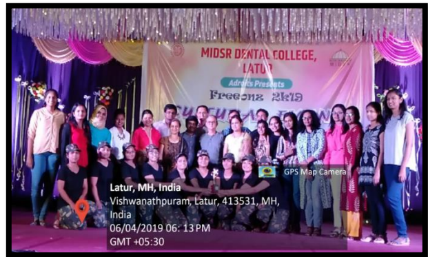
GROUP PHOTO OF CULTURAL EVENT