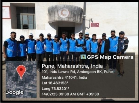
PARTICIPANTS OF CRICKET FEST 2023