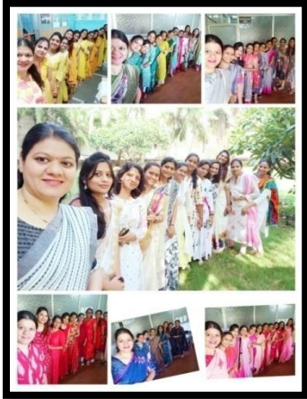
NAVARATRI DAY CELEBRATION