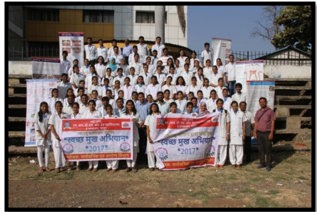
Swatch Mukh Abhiyan