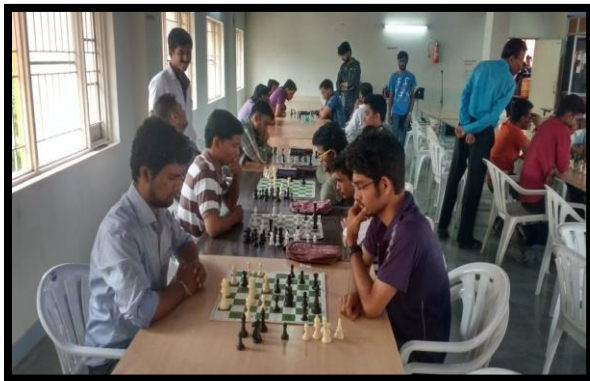
All India University Chess Selection Trails of MUHS