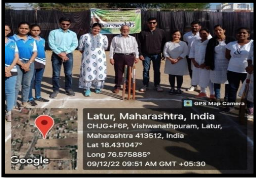
INAGURATION OF OUTDOOR SPORTS