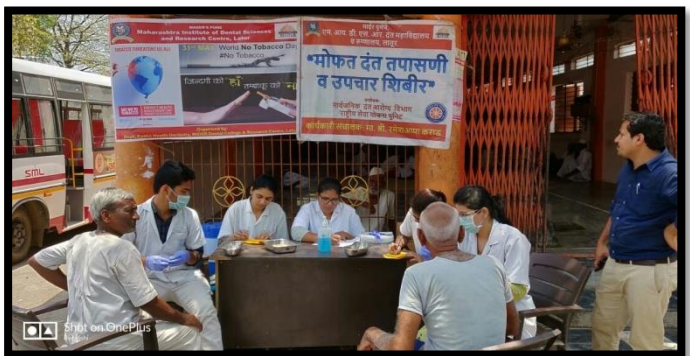
WORLD NO TOBACCO DAY