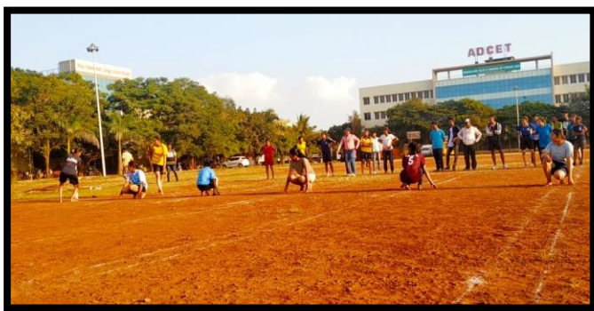
MARATHWADA ZONAL TRIALS OF MUHS NASHIK- KHO KHO