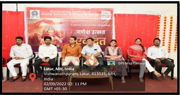
JUDGES AND STUDENTS OF MODAK MAKING COMPETITIONS