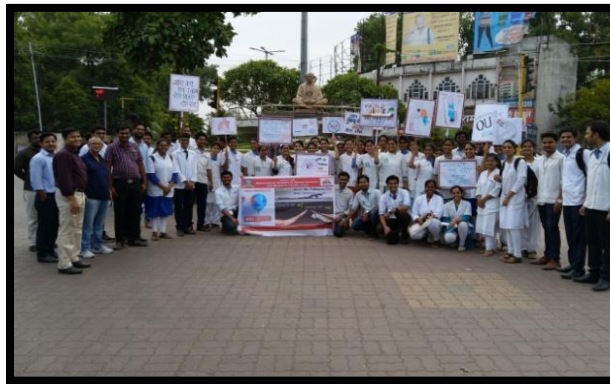
WORLD NO TOBACCO DAY