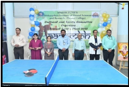
AARAMBH SPORTS MEET 2022