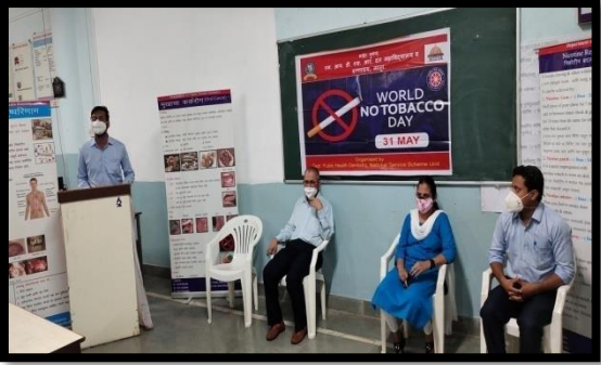
WORLD NO TOBACCO DAY