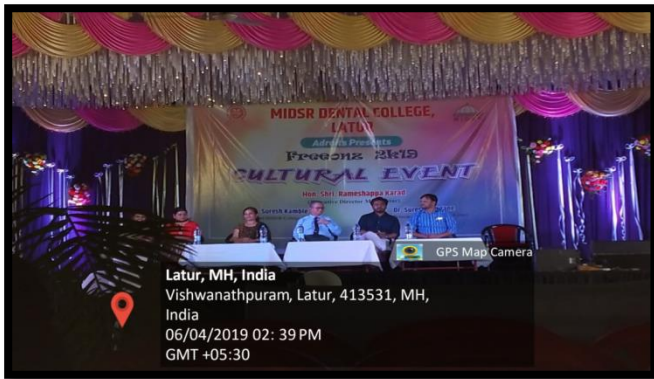
INUGURATION CEREMONY OF CULTURAL EVENT