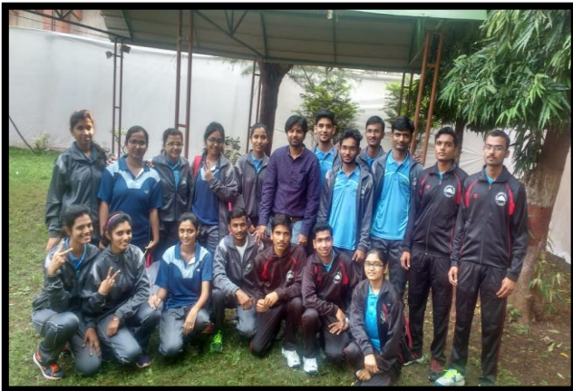
Interzonal Trials Of MUHS Nashik