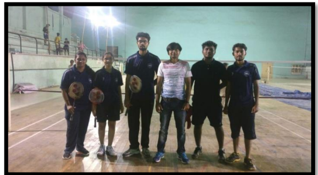
All India University Badminton Selction Trails