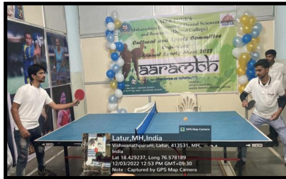
STUDENTS PLAYING TABLE TENNIS