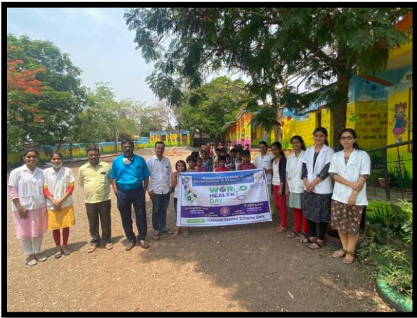
World Oral Health Day