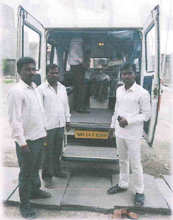
Mobile Dental Unit (MDU) equipped with one dental chair.