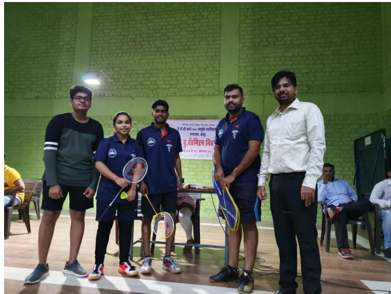
BADMINTON TEAM WITH SPORTS INCHARGE