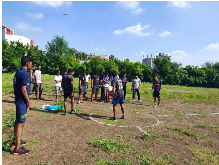
SHOT PUT EVENT AT SPORTS GROUND