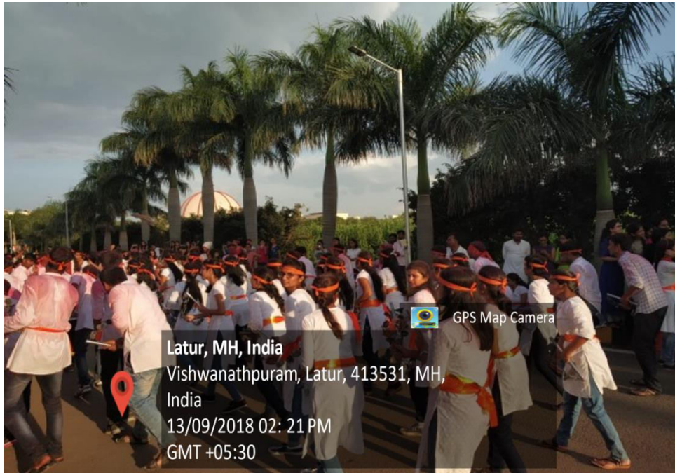
GANESHA MURTI WELCOME BY LEZIM PERFORMANCE