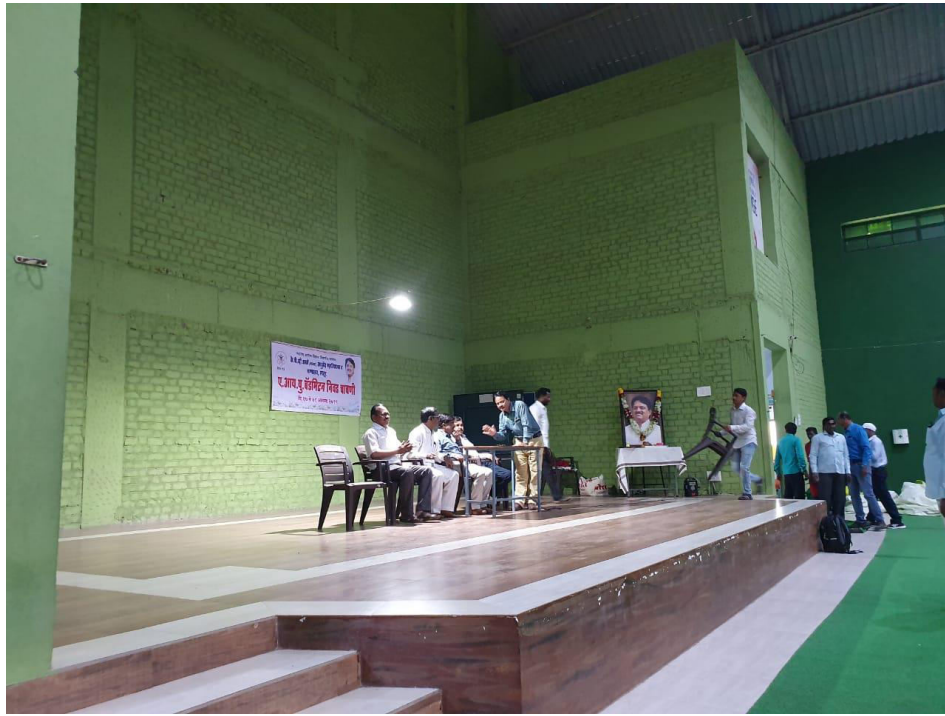
INAGUARTION CEREMONY OF SPORTS EVENT