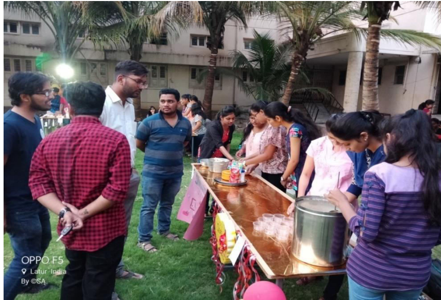
FOOD FIESTA CELEBRATION BY STUDENTS AND STAFF