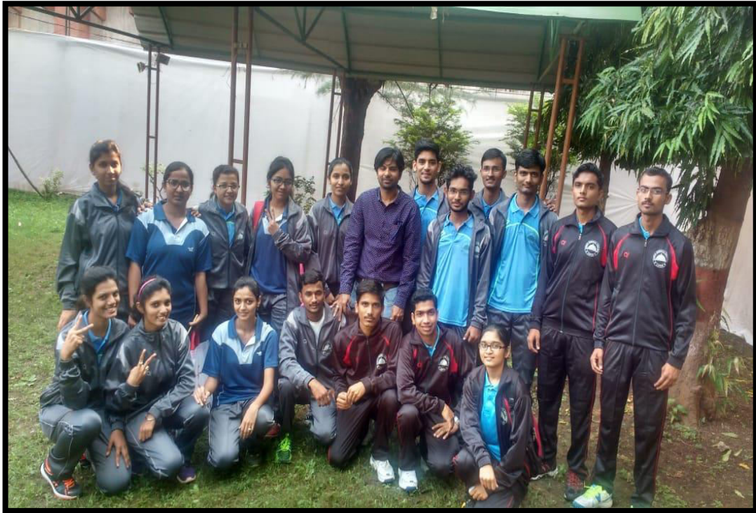
PARTICIPANTS FOR INTERZONAL TRIALS OF MUHS NASHIK