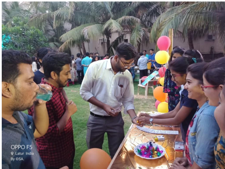
FOOD FIESTA CELEBRATION BY STUDENTS AND STAFF