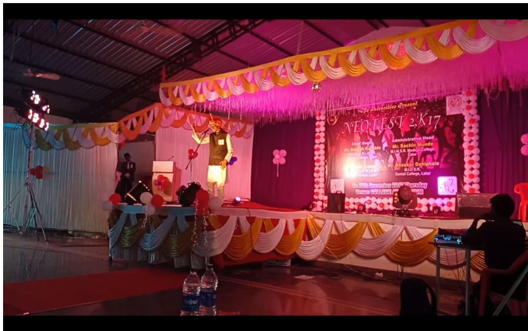
SOLO PERFORMANCE BY FIRST YEAR STUDENTS