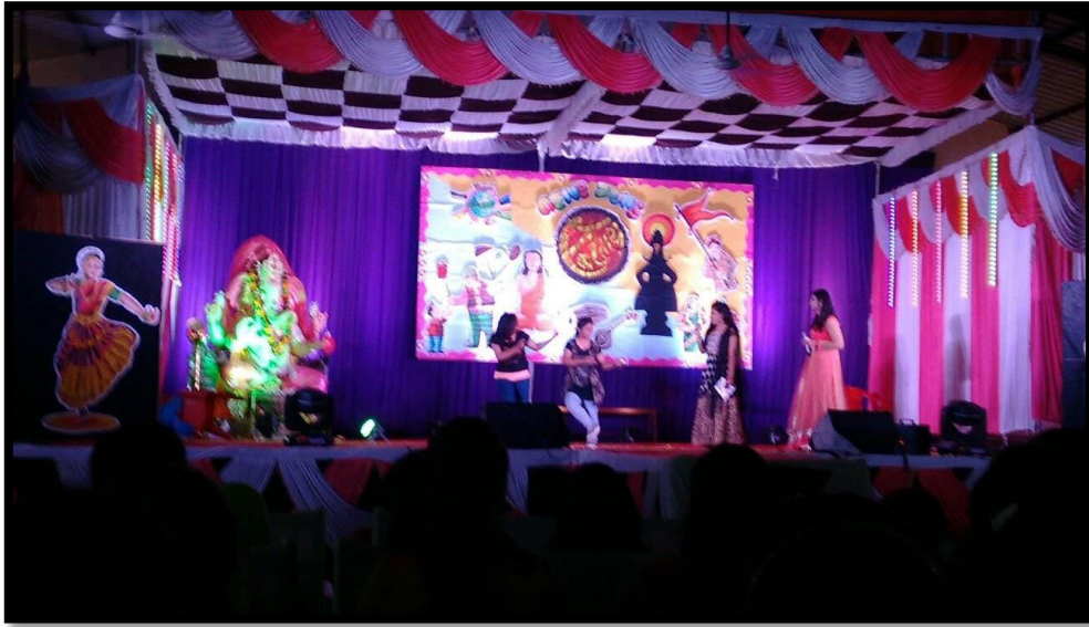
GROUP PERFORMANCE FOR GANESH UTSAV CELEBRATION