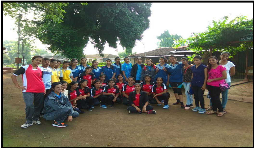
PARTICIPANTS FOR INTERZONAL TRIALS OF MUHS NASHIK