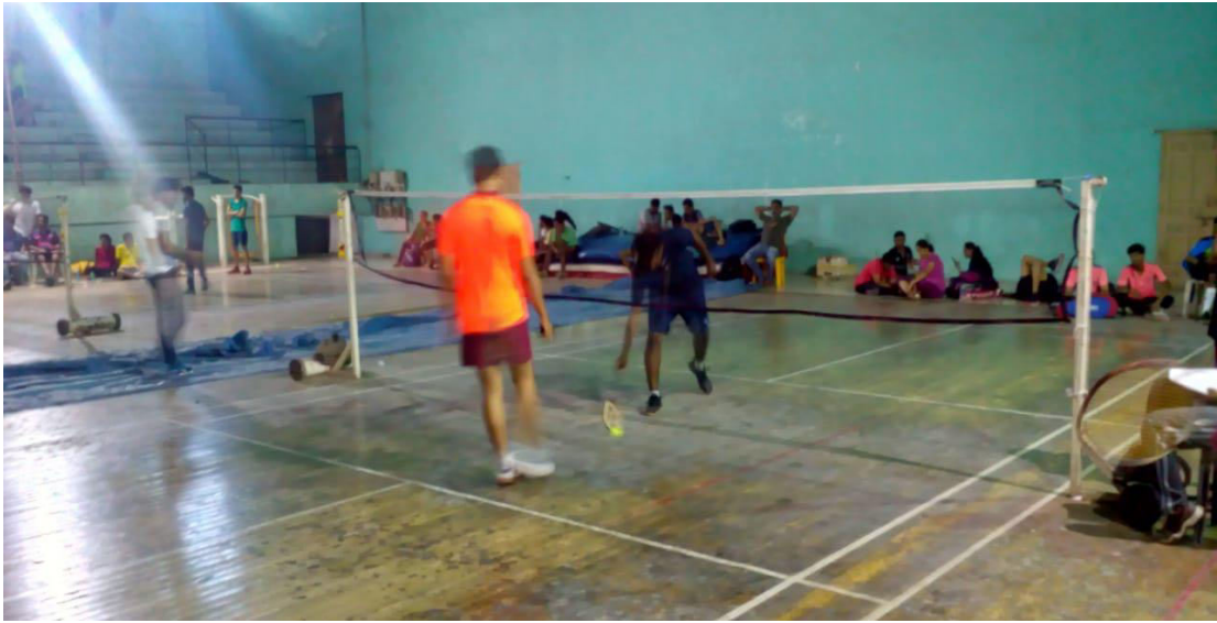
PARTICIPANTS OF BADMINTON EVENT WITH STAFF INCHARGE