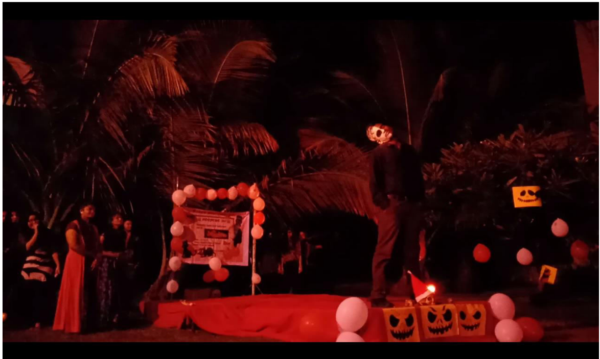
HALLOWEEN DAY EVENT