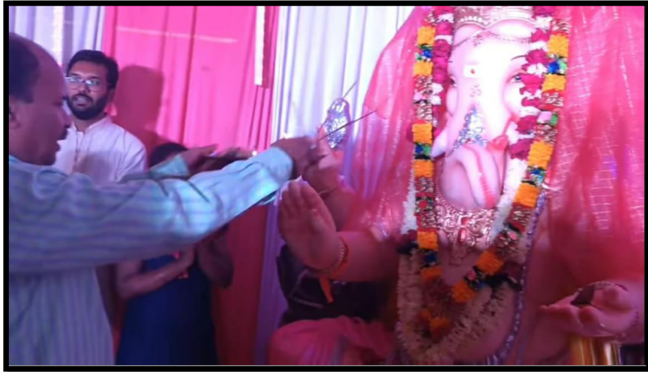
ANAPATI AARATI BY STAFF AND STUDENTS