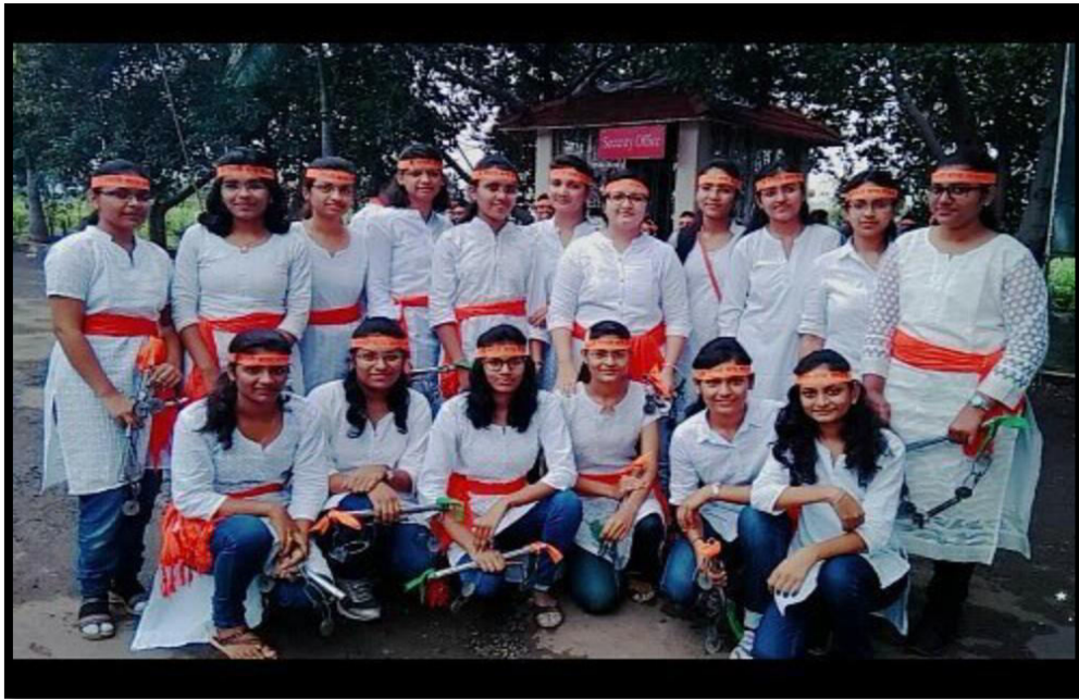
STUDENTS GROUP CELEBRATING GANESH UTSAV CELEBRATION

Convener, Sports & Cultural Committee, MIDSR Dental College, Latur.