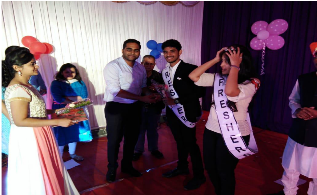
WINNER OF MR. & MISS. FRESHER'S 2017