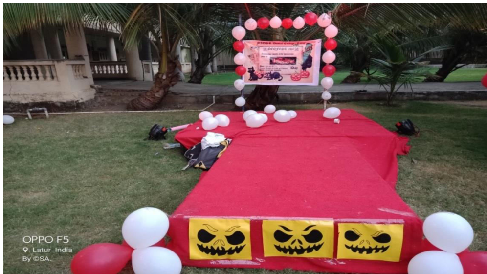
HALLOWEEN DAY EVENT –STAGE DECORATION