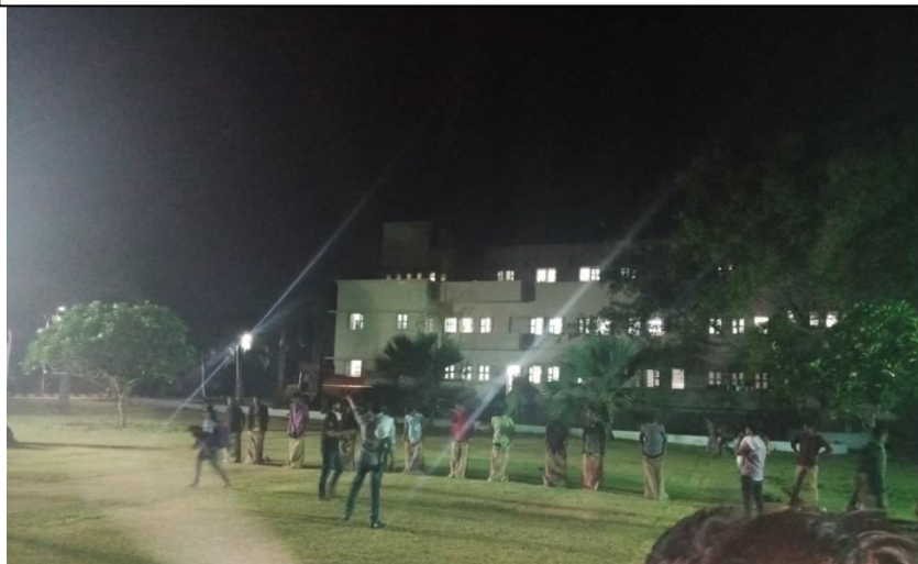
SAC RACE PERFORMANCE ON GROUND