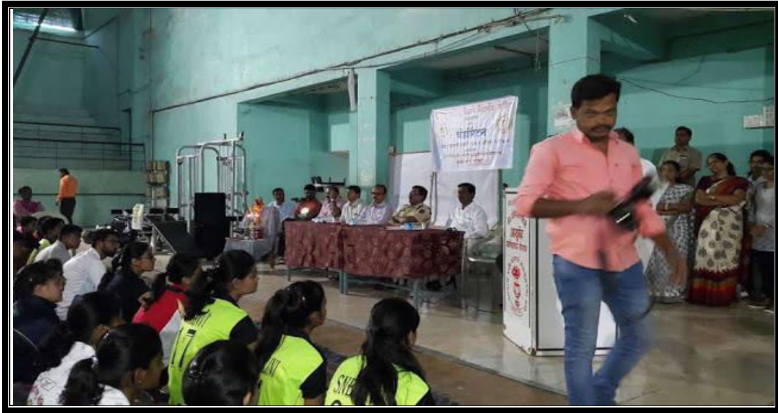
INAUGURATION CEREMONY OF SPORTS EVENT