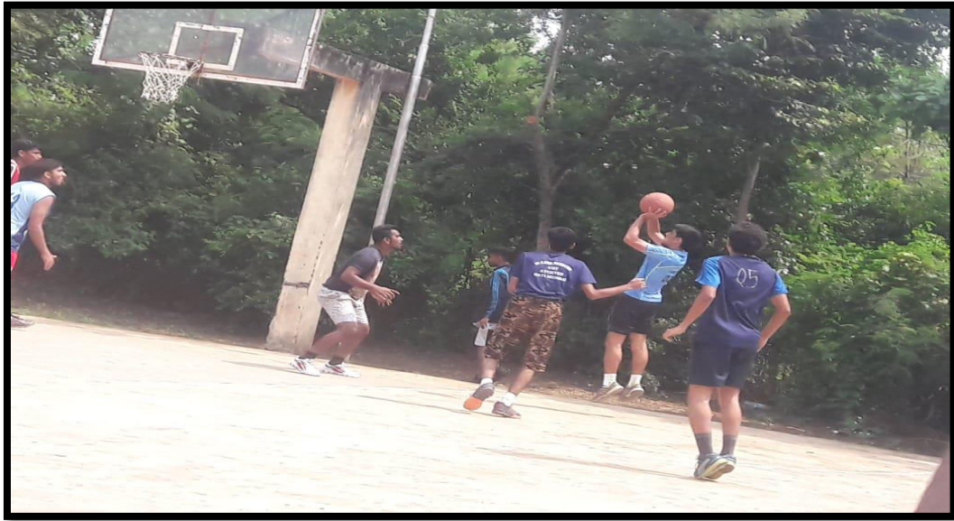
PARTICIPANTS FOR INTERZONAL TRIALS OF MUHS NASHIK