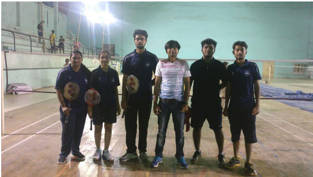
PARTICIPANTS OF BADMINTON EVENT WITH STAFF INCHARGE