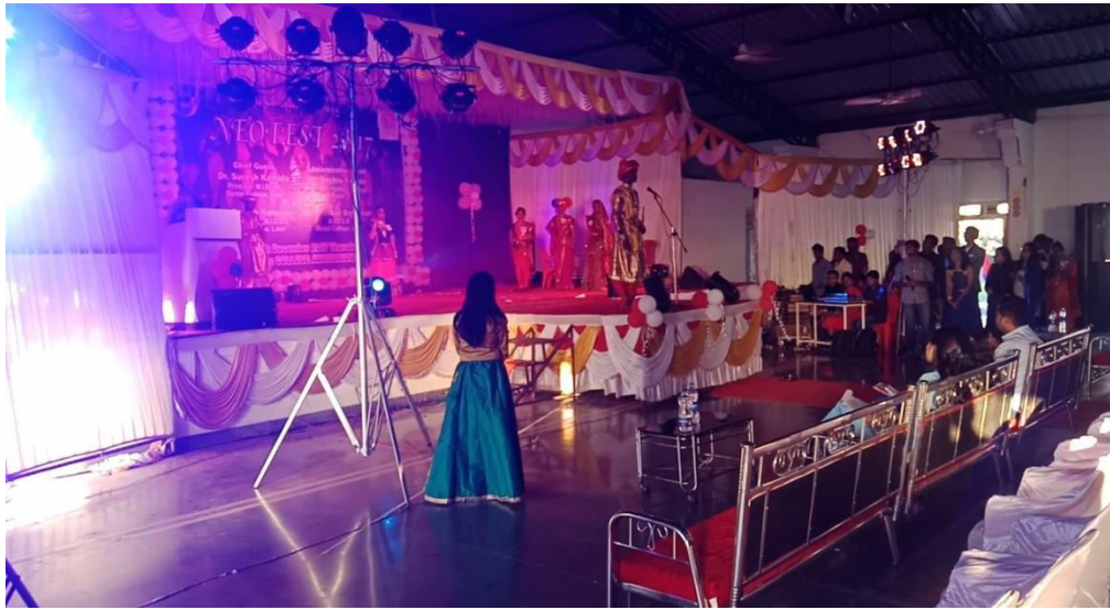
HISTORICAL THEME PLAYED BY FIRST YEAR STUDENTS