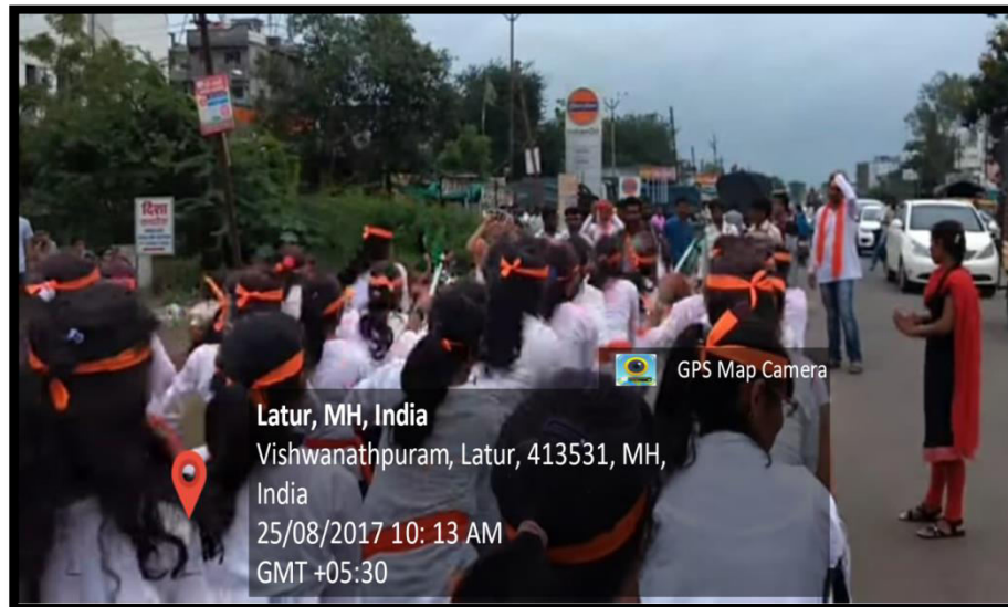
GANAPATI WELCOME WITH LEZIM, DHOL BY STUDENTS