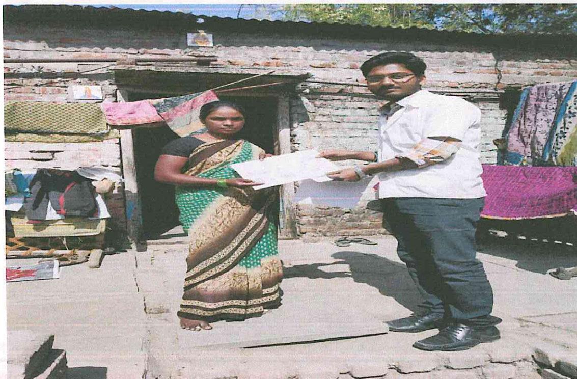
Spreading awareness about maintaining hygiene and distributing pamphlets