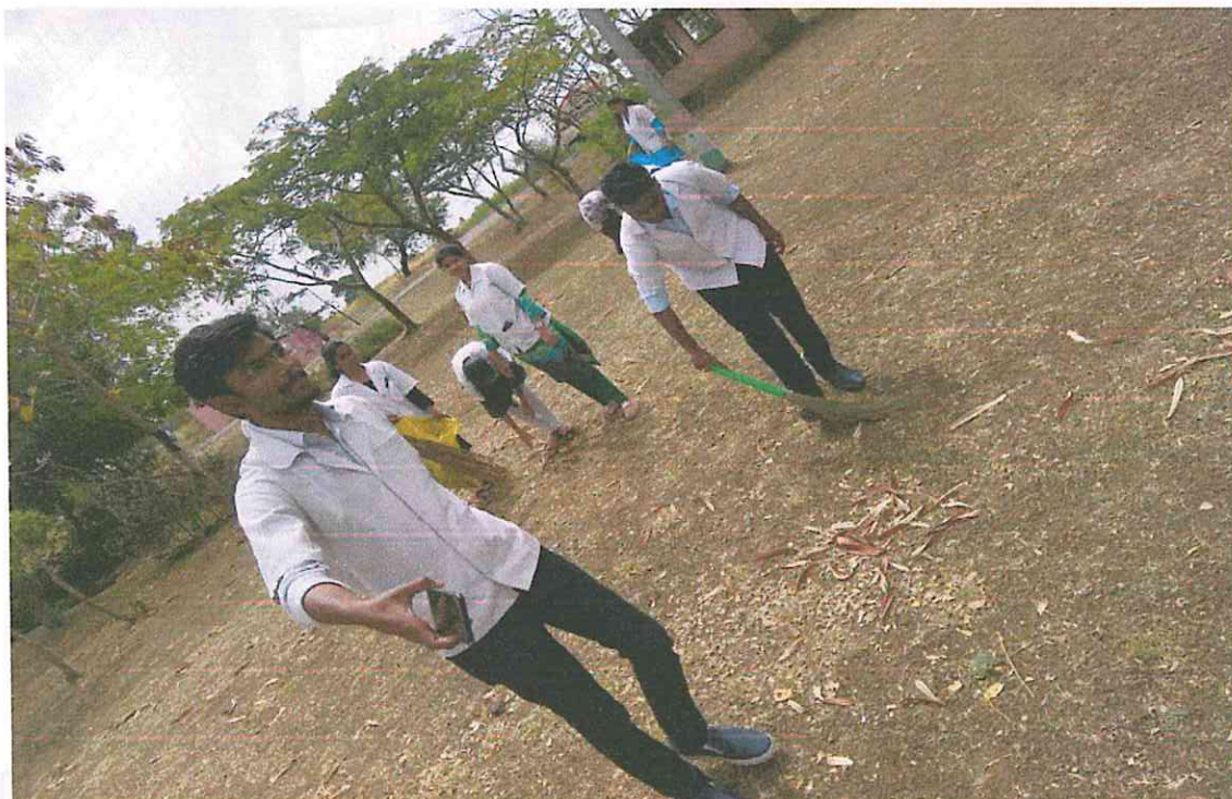
Village area cleaning done by students during camp

Email : principal@mitmidr.edu , midr.latur@gmail.com Website : www.mitmidr.edu.in