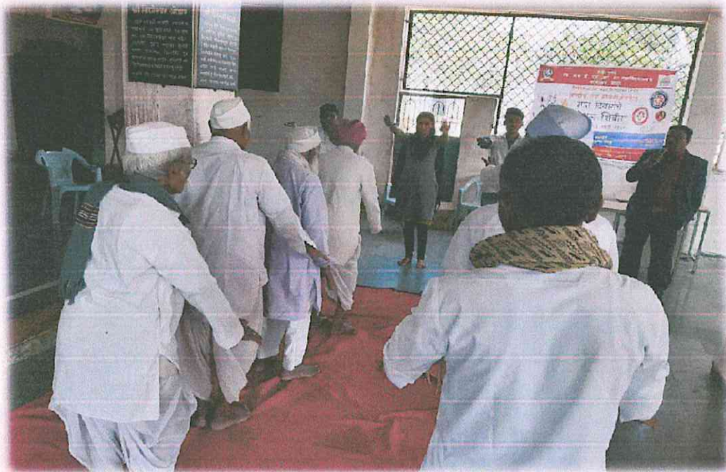
Physiotherapist demonstrating various daily exercises and its importance.