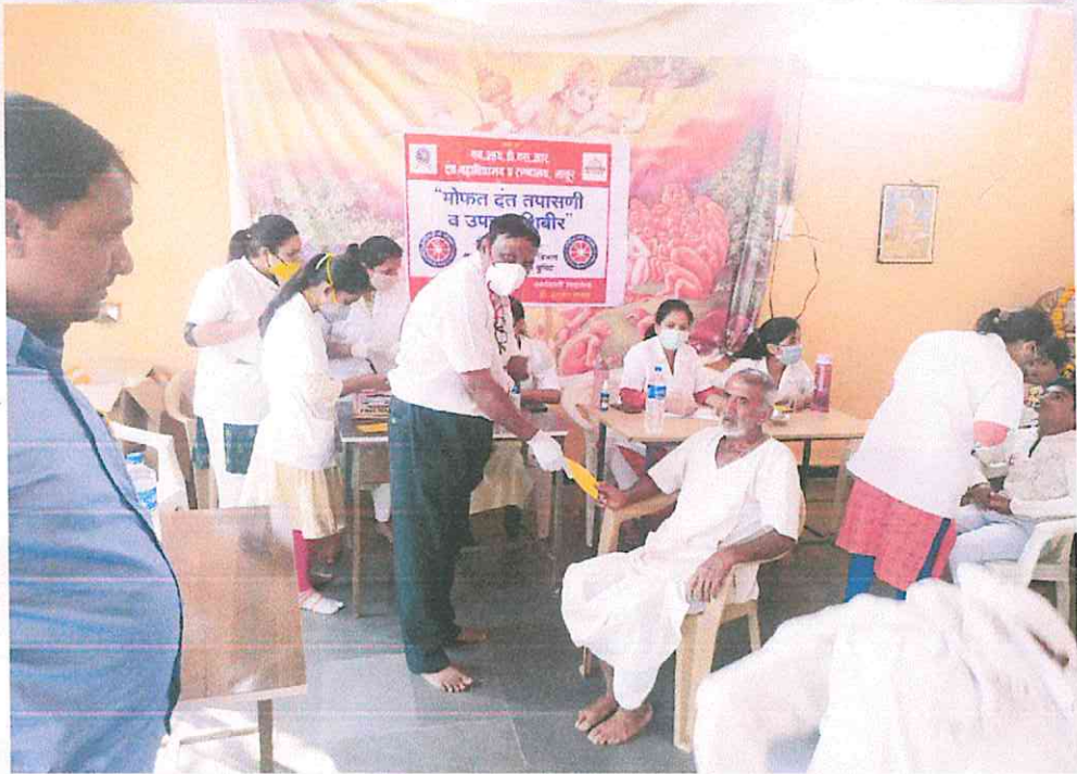
Oral screening done , instructions given regarding maintenance of oral hygiene and free dental treatment cards were distributed.

Sangam Principal M. I. D. S. R. Dental College LATUR