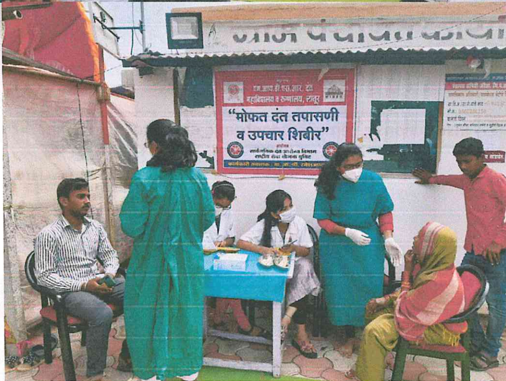
Oral screening done and instructions given regarding maintainance of oral hygiene.