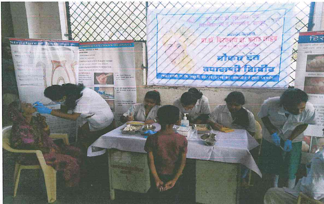
Distribution of free dental treatment cards and instructions given to maintain good oral health.