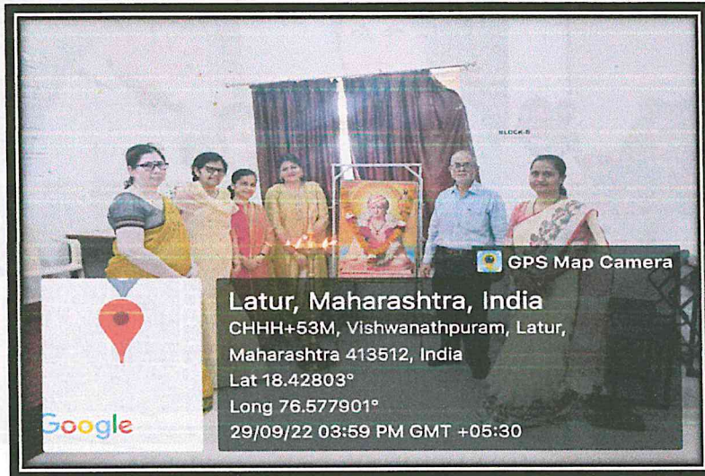
LAMP LIGHTNING & SARASWATI PUJAN BY GUESTS