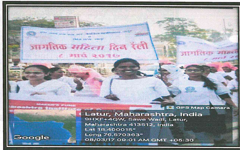
RALLY GOING THROUGH THE CITY