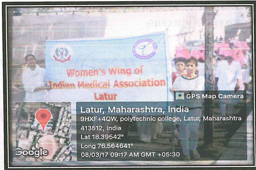
RALLY GOING THROUGH THE CITY