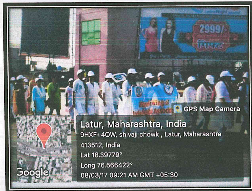
RALLY ENDED AT POLYTECHNIQUE GROUND LATUR