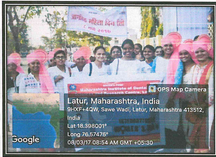
RALLY STARTED AT TOWN HALL LATUR